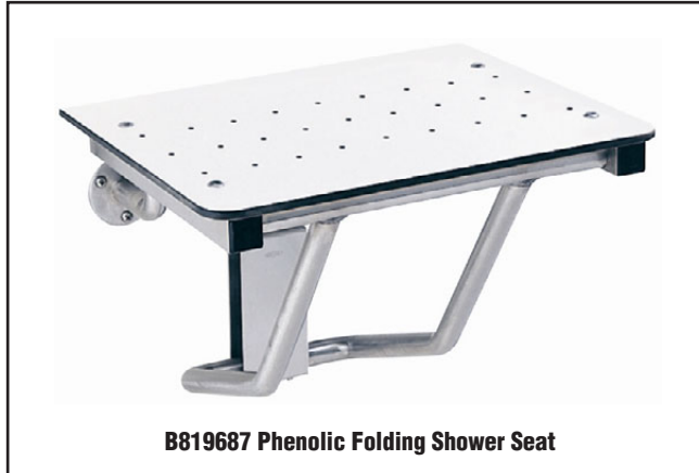
B819687 Phenolic Folding Shower Seat