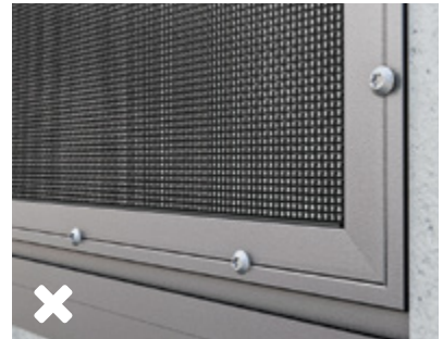
Traditional face fix methods leave unsightly visible screws