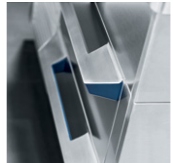
Refrigerated / Freezer Base