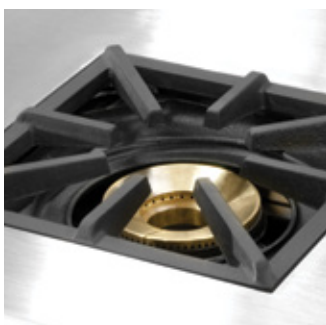
HP Single Burner