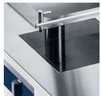
Full Surface Induction