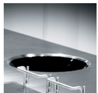
High Power Induction Wok