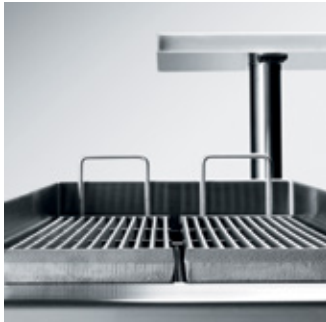
High Power Chargrill