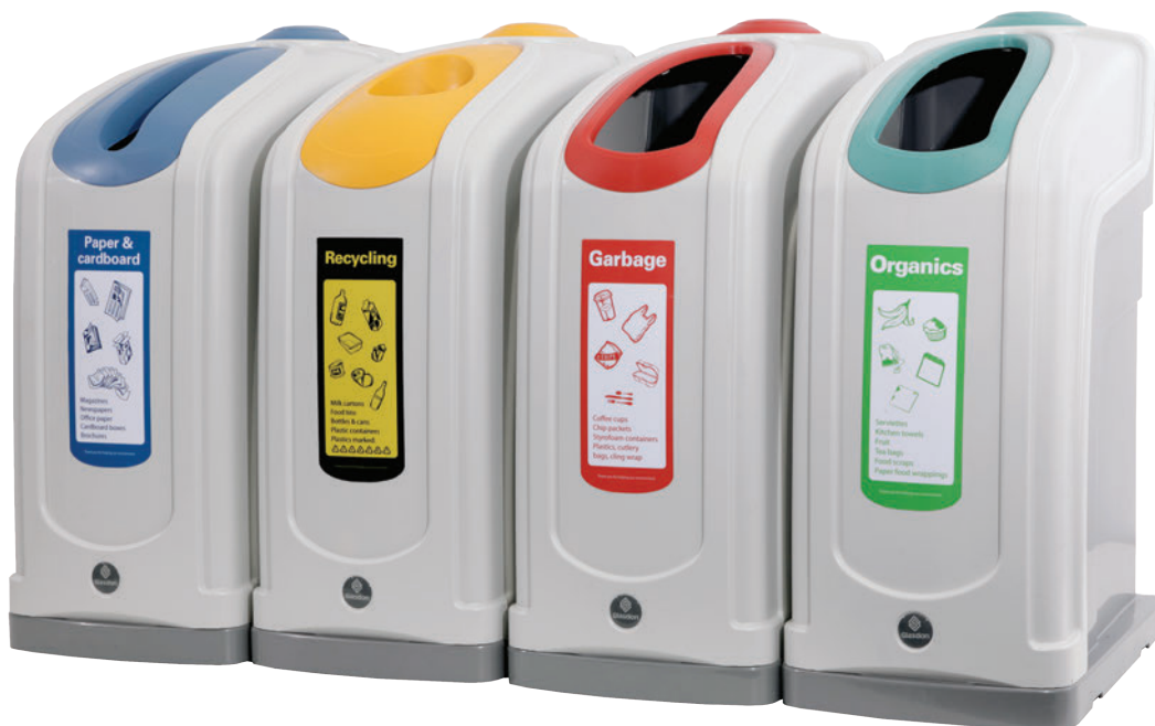
With signage kit