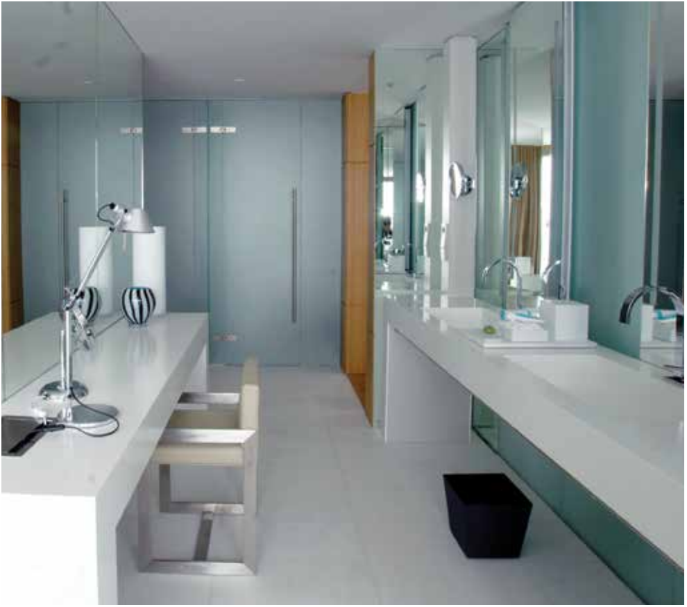
W Barcelona Hotel, Spain; project by Ricardo Bofill