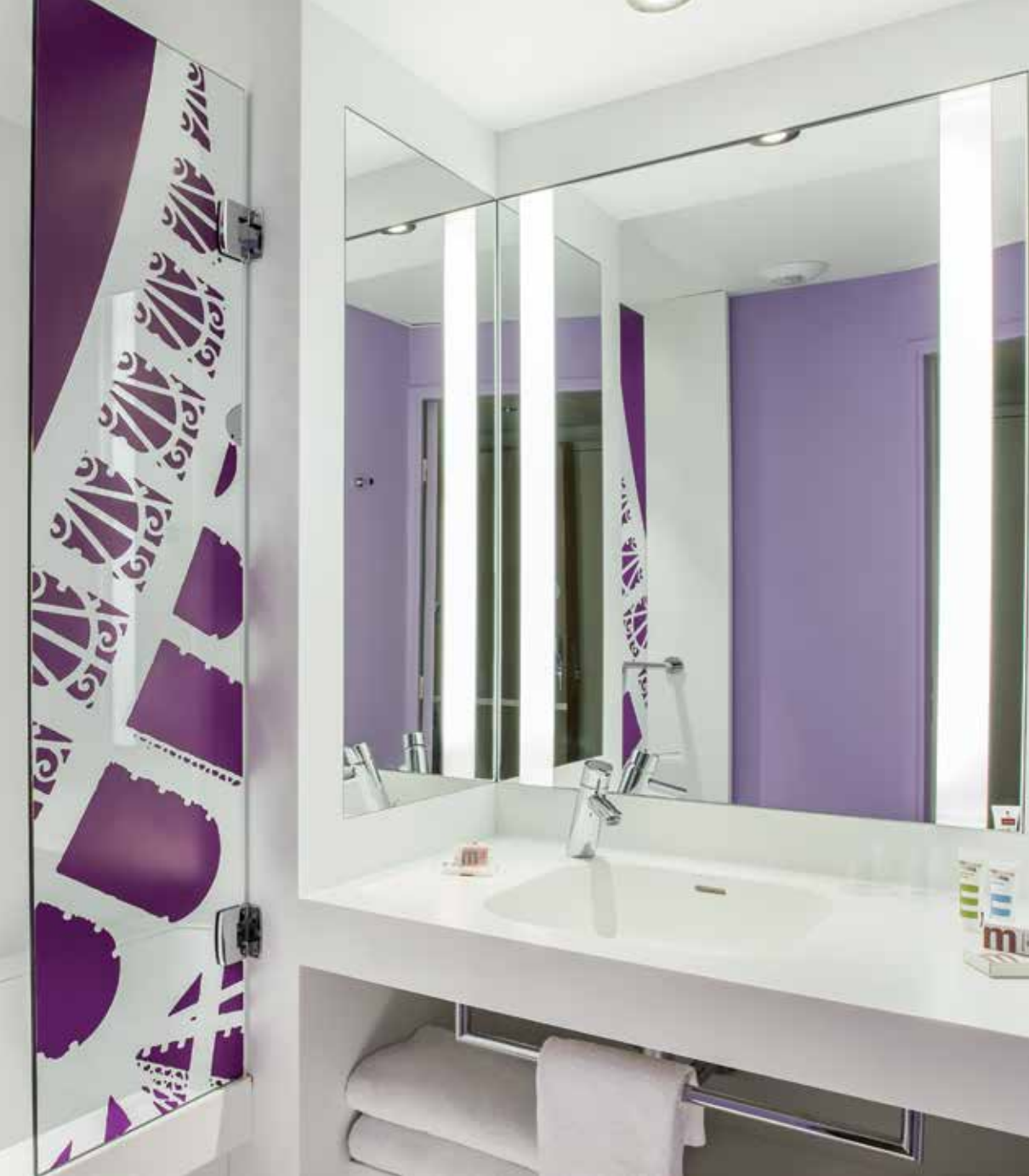
Hotel Mercure Paris Centre Tour Eiffel, Paris, France; photo Stefan Kraus, courtesy of Accor.