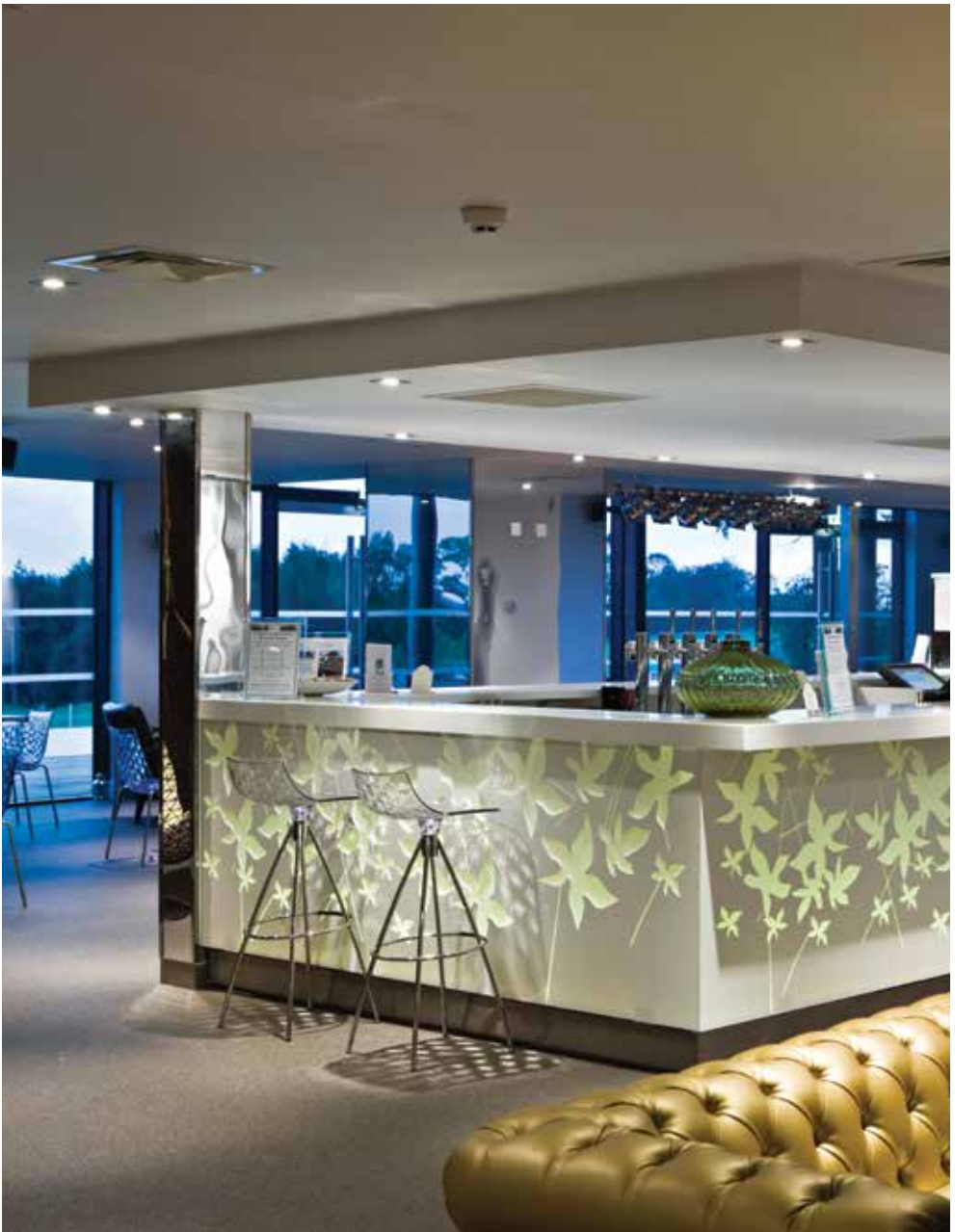
Left: Inamo restaurant, London, UK; design by Blacksheep Architecture and Design; Above: Percy Kildwick Golf Club in York, UK