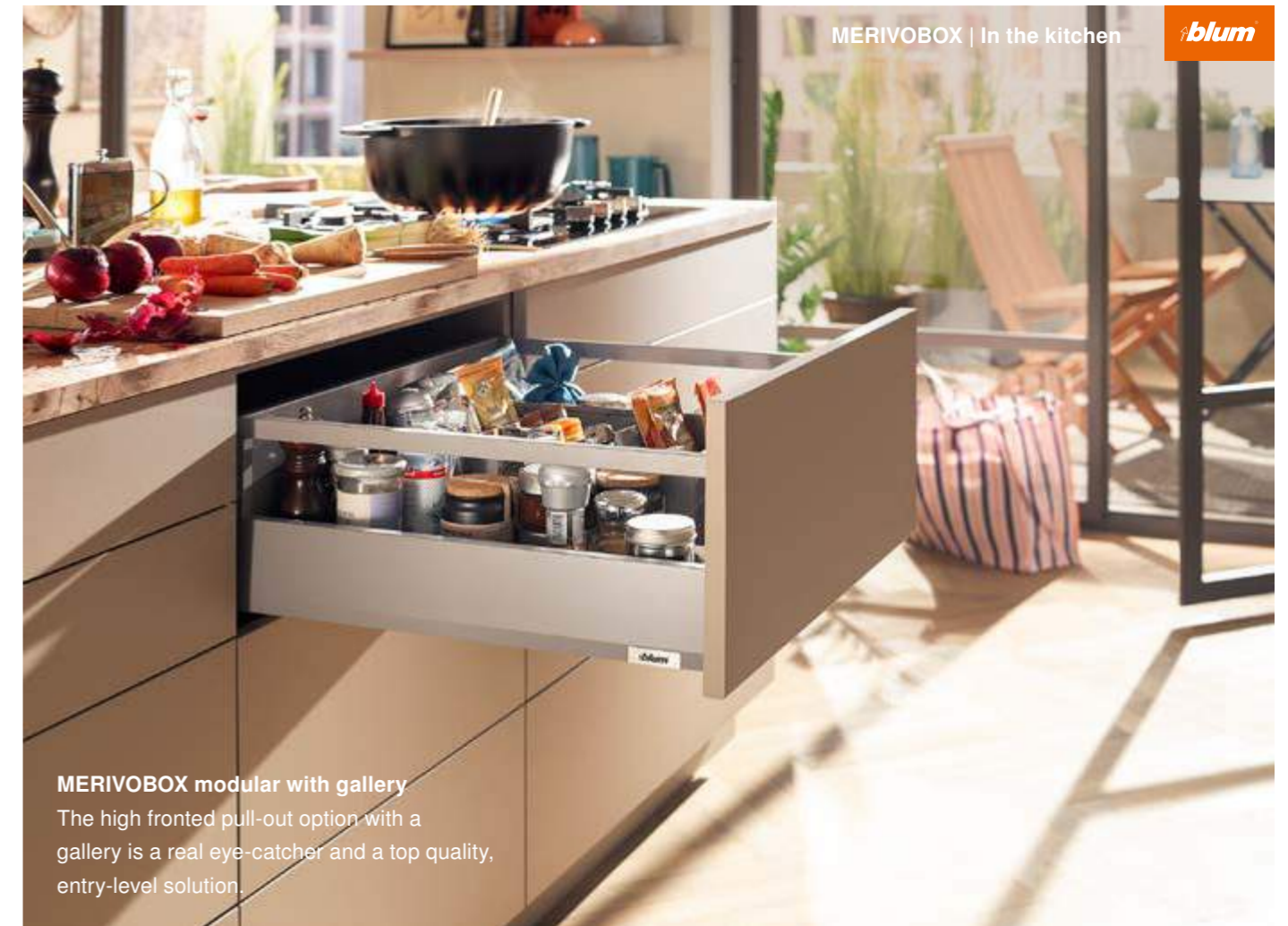
MERIVOBX modular with gallery The high fronted pull-out option with a gallery is a real eye-catcher and a top quality, entry-level solution.

Its impressive functions make MERIVOBX ideal for the kitchen. Regardless of what's cooking, our latest box system ensures that kitchen users have clear visibility and ergonomic access to all storage items. Choose the right model to suit the application and your preferences. MERIVOBX is a reliable partner – and not just for cooking. For the lifetime of the furniture.