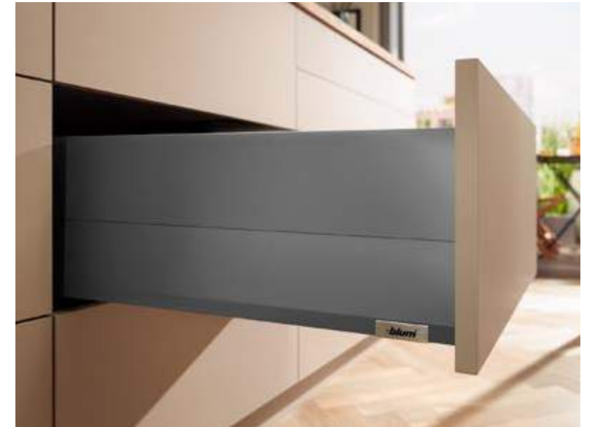
MERIVOBX modular with BOXCAP in orion grey matt

The choice is yours: our coordinated colour concept