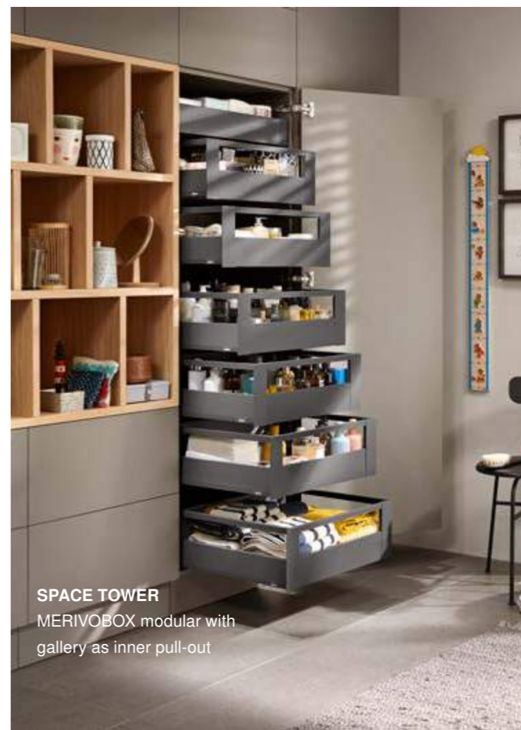
SPACE TOWER MERIVOBX modular with gallery as inner pull-out

Regardless of the application, MERIVOBX looks just as good in the bathroom. Be it in the form of the SPACE TOWER, SPACE STEP or a conventional washstand, maximise the existing space and make day-to-day life easier. A stunning design enables you to meet customer requirements – no matter which version you opt for.