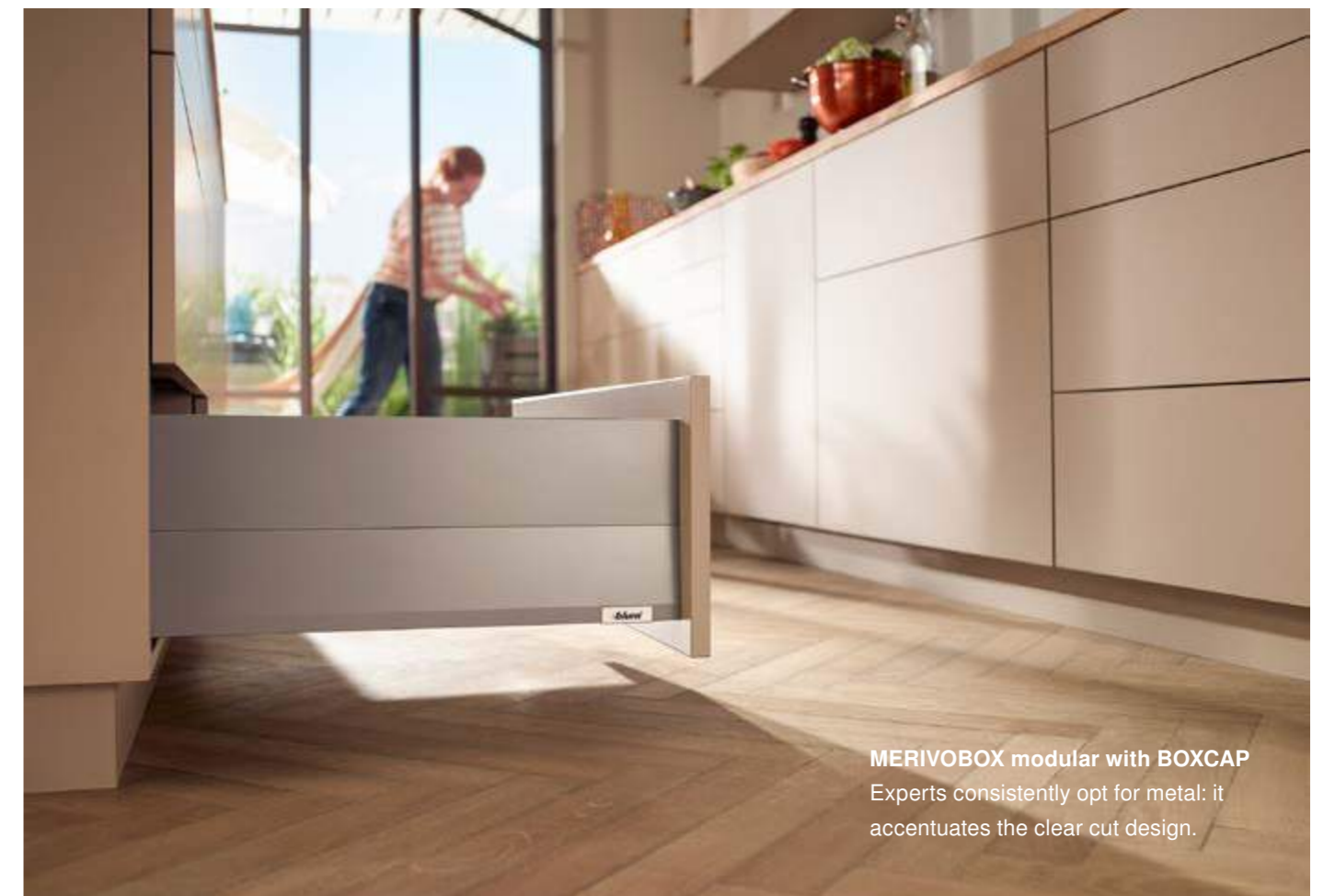
MERIVOBX modular with BOXCAP Experts consistently opt for metal: it accentuates the clear cut design.