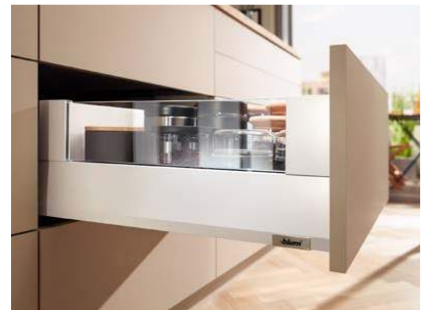
MERIVOBX modular with BOXCOVER in silk white matt