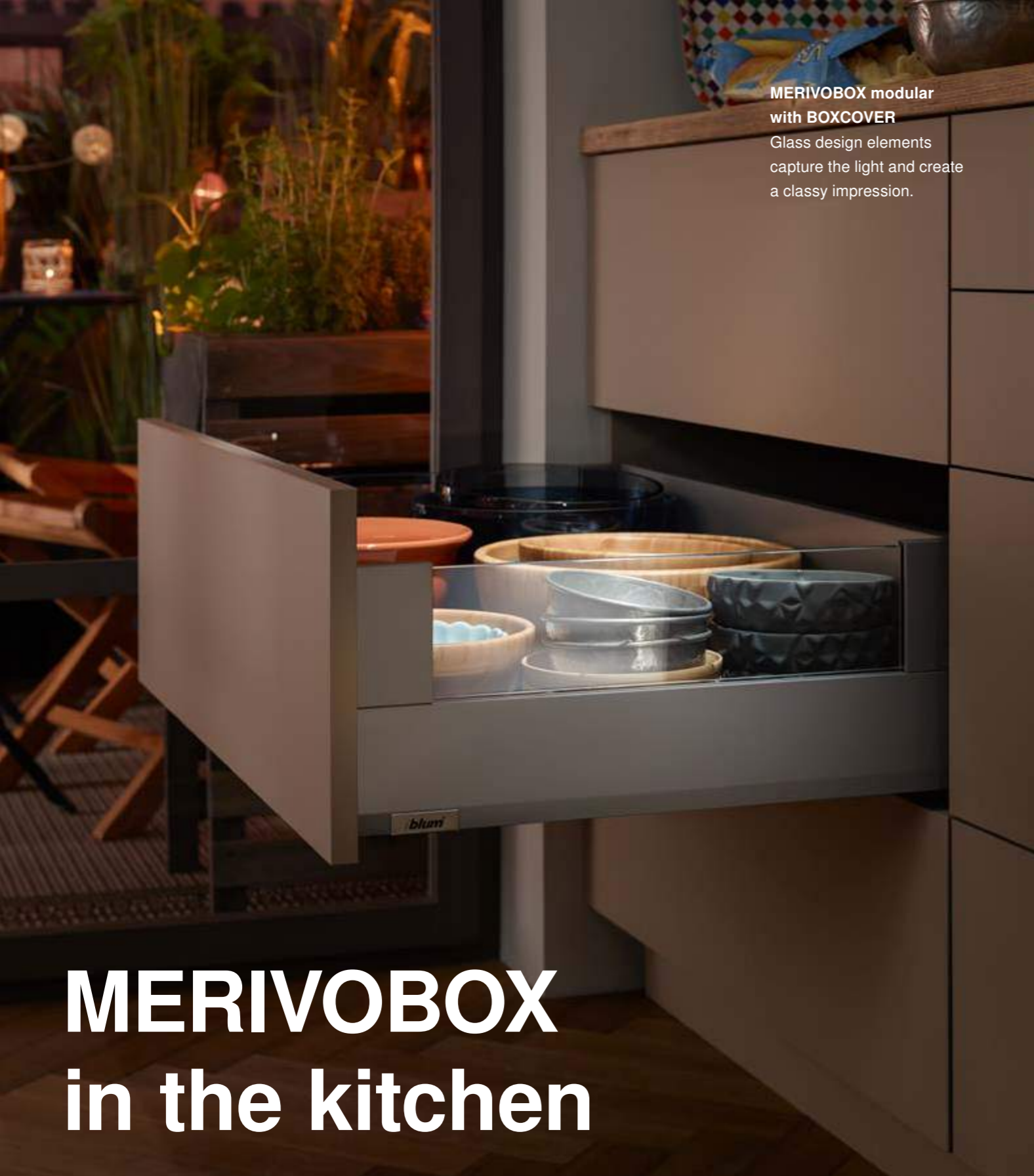
MERIVOBX modular with BOXCOVER Glass design elements capture the light and create a classy impression.