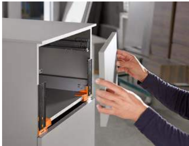
Marking template for MERIVOBX