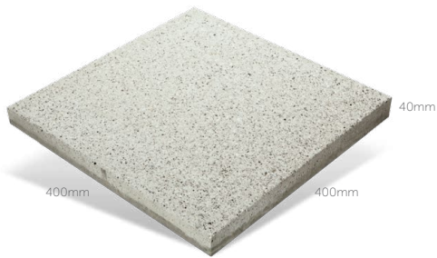
Euro® Stone 6.25 units per m 2