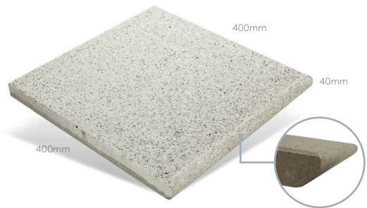
Euro® Stone Sharknose 2.50 units per lineal metre *This product is made to order, lead times apply.