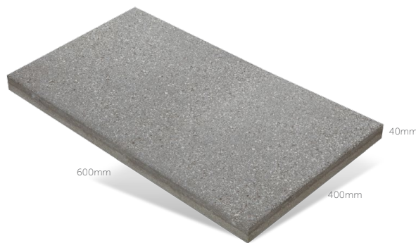
Euro® Stone 600 x 400 4.16 units per m 2