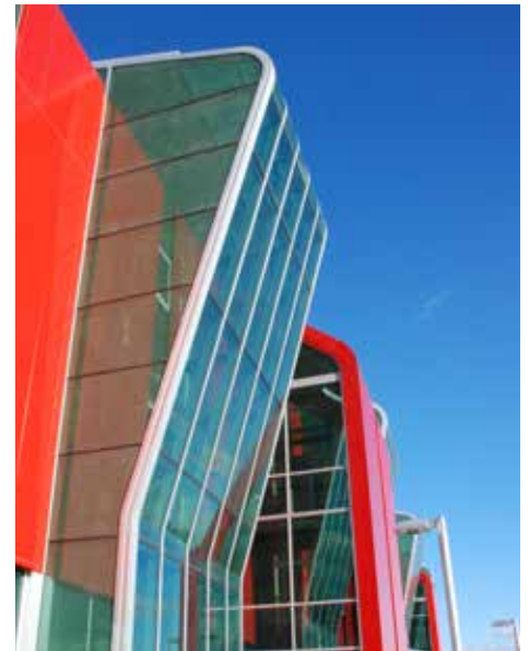
DGU: 6mm reflective coated Low E toughed curved glass. 12mm swiggle seal air space. Internal pane: 13mm clear toughened laminated curved glass