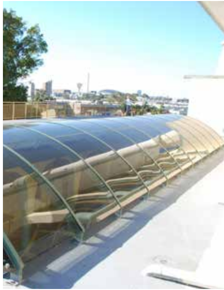
13mm grey laminated annealed curved glass vaulted glazed roof