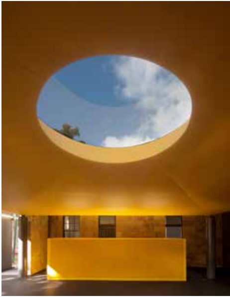
14.76mm low E laminated curved glass dome light to child care centre, internal view