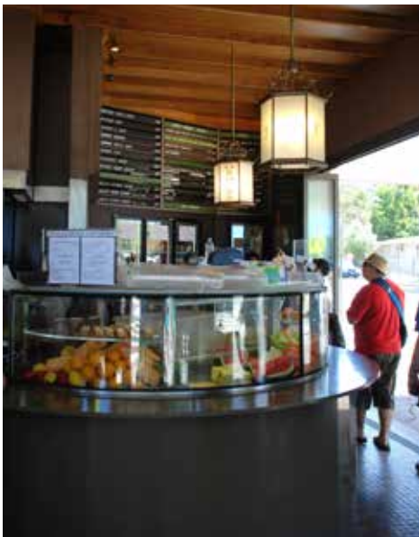
double glazed toughened curved glass Custom profile