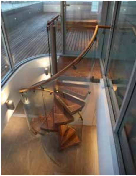
10mm clear toughened curved glass stair balustrade