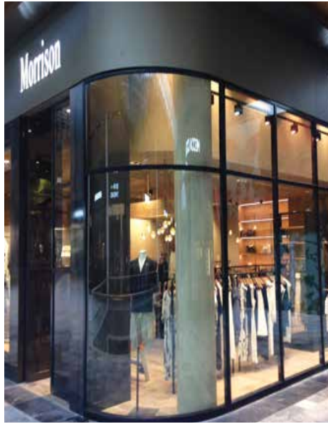
12.76mm clear annealed laminated curved glass shop window