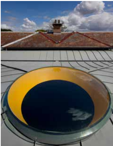
14.76mm low E laminated curved glass dome light to child care centre, external view