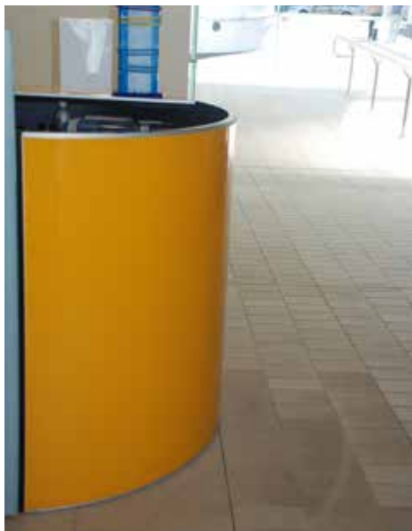
6mm yellow colourback starphire toughened curved glass Ian Thrope Aquatic Centre, Ultimo NSW