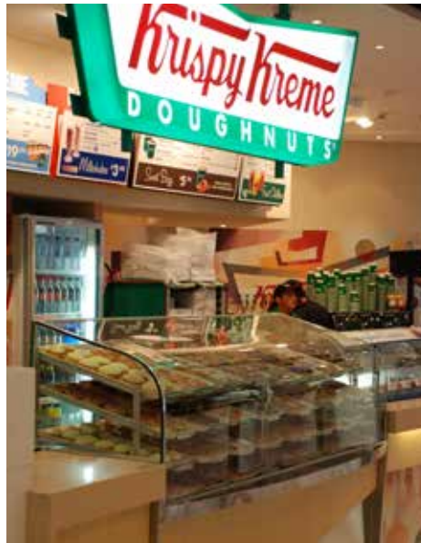
6mm clear annealed glass Profile 'D' inverted