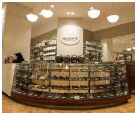
10.76mm clear annealed toughened curved glass counter