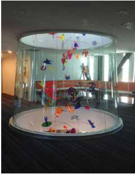
12.76mm clear laminated conical shaped curved glass