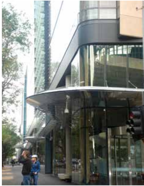
12.76mm low E laminated curved glass windows