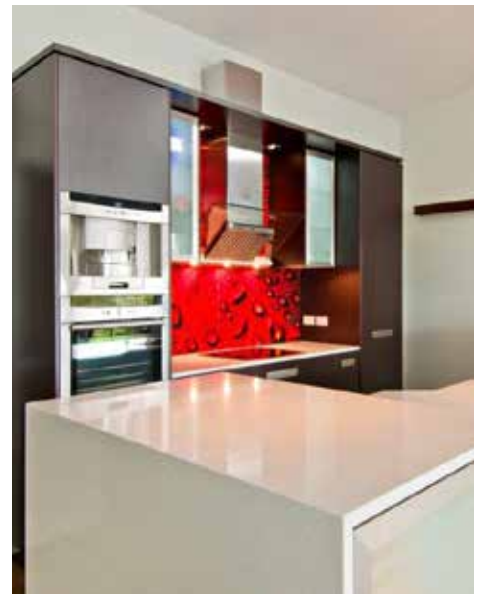
Digital image splashback