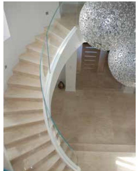
15.04mm Starphire toughened structural laminated curved glass stair balustrade. Engineered glass to allow compliant fully frameless installation without top rail/handrail