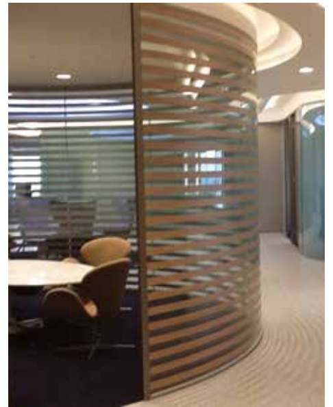
10.76mm clear laminated curved glass with applied timber slats