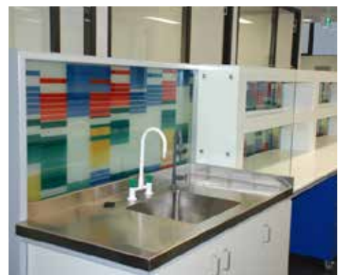
Digital image splashback