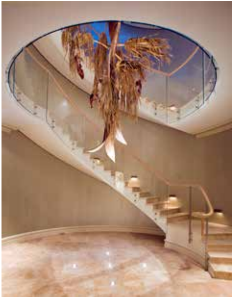
12mm starphire low iron toughened curved glass. Frameless cantilever balustrade panels. Side fix standoff fittings timber handrail capping to top edge of glass