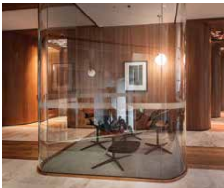
10.76mm clear laminated curved glass office suite