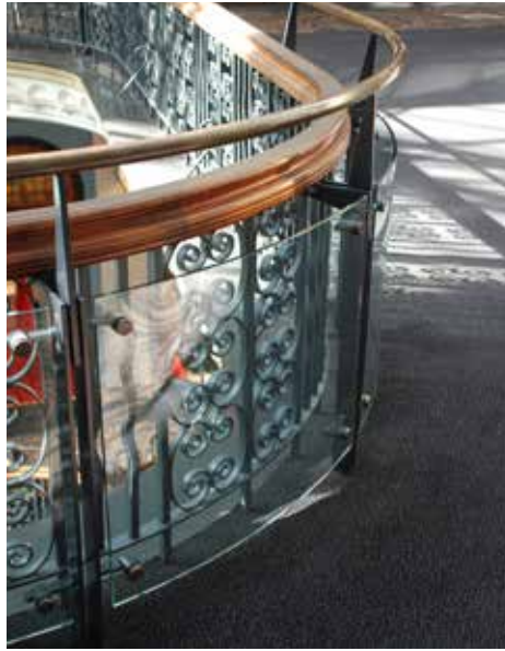
10mm toughened curved glass balustrade