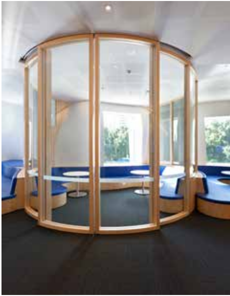
12.76mm clear laminated curved glass fixed and sliding panels