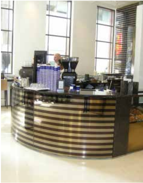
Bronze toughened curved glass with digital mirror Lindt chocolate cafe, Sydney