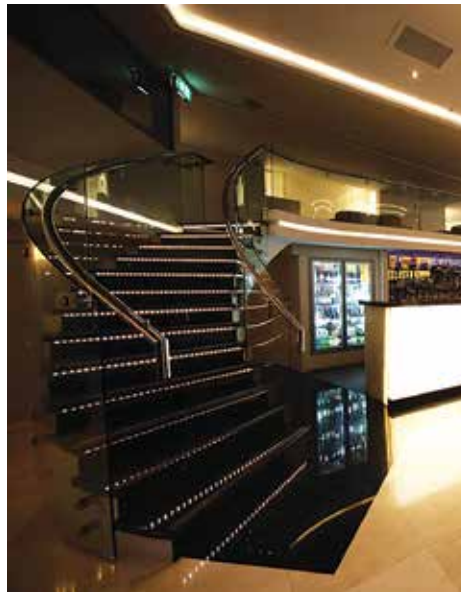
12mm clear toughened curved glass stair balustrade