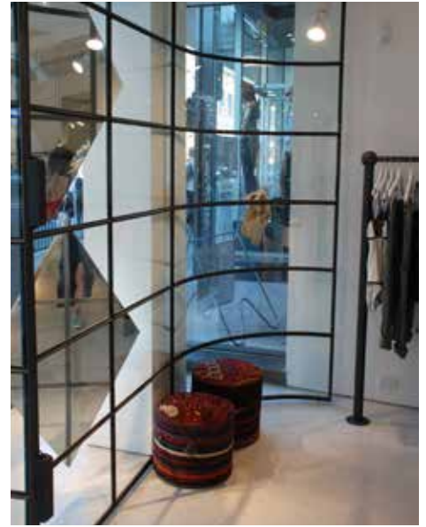
6.76mm Starphire laminated curved glass shop front