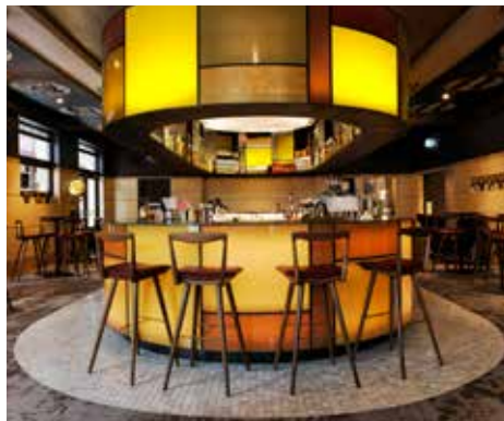
custom coloured graphic laminated curved and flat glass - Montage graphix coloured insert