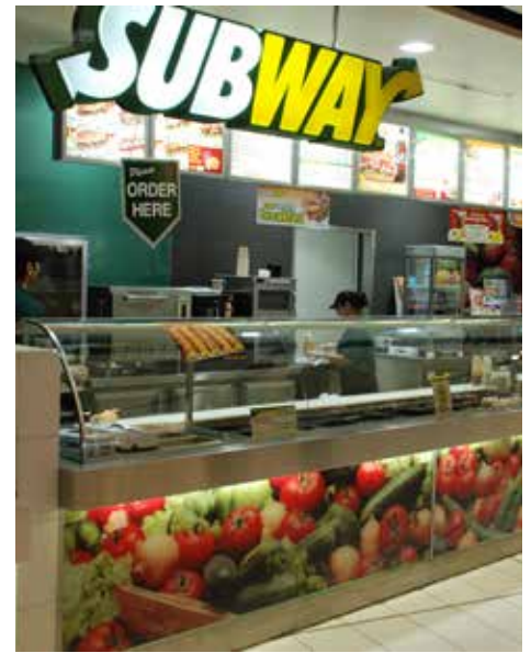
6.76mm clear laminated curved glass Standard profile 'G'