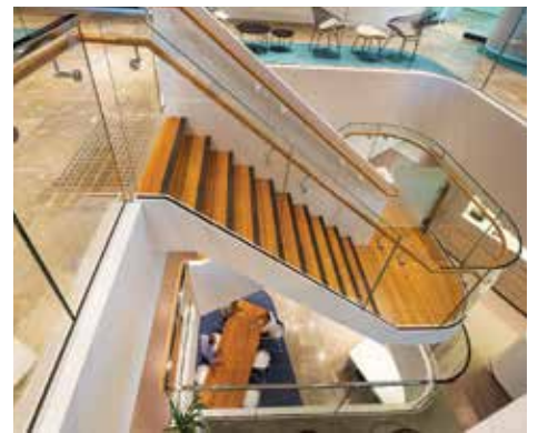
21.52mm Low iron toughened laminated curved and flat glass. Side fixed frameless top & side edges with stainless steel