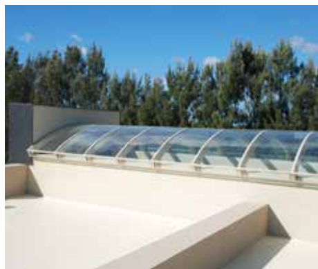
12.76mm clear laminated curved glass to barrel vaulted roof light external view