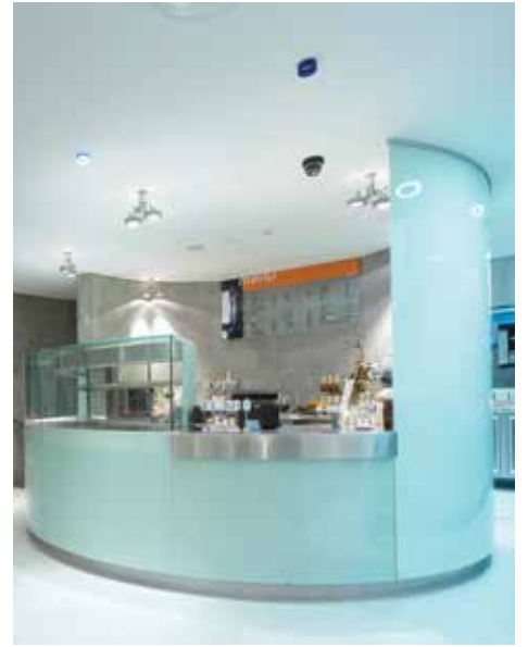
10mm clear toughened & colourbacked curved glass food display counter