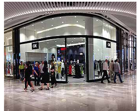
top panel 8mm clear toughened curved glass bottom panel 16.76mm clear annealed laminated curved glass shop window