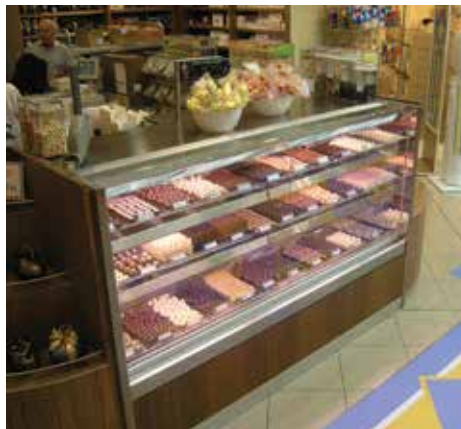
6mm clear annealed curved glass Standard Profile 'AF'