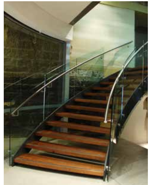
15mm clear toughened curved glass cantilever balustrade panels stand off fittings to side of steel stair stringer