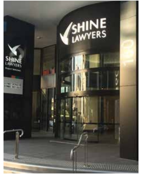
12mm clear toughened curved glass entry door facade and 12.76mm clear annealed laminated curved glass fixed panels