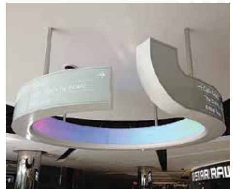
6mm Amiran low iron anti-reflective double coated toughened curved glass The Star Casino directional signage