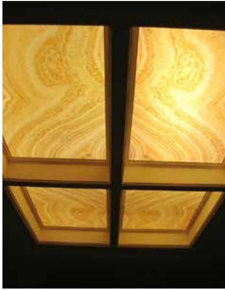
Natural stone image Skylight