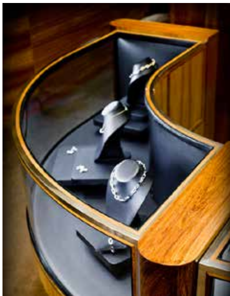
6mm clear annealed curved glass jewellery display counter