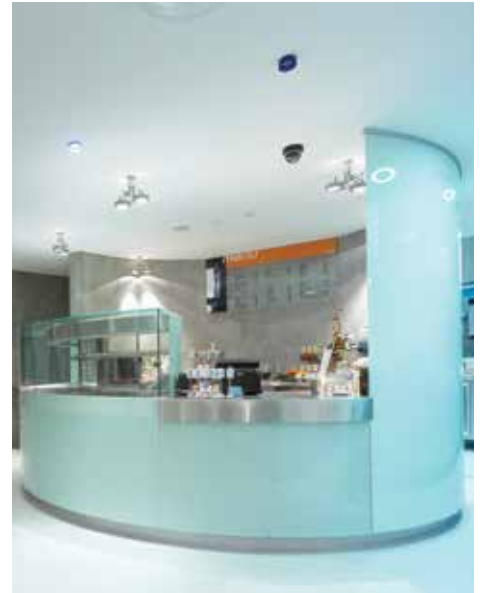
10mm clear toughened and colourback curved glass food counter Awash carwash & Cafe, Gladesville NSW