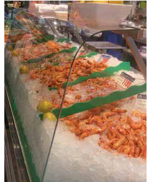
6mm clear annealed curved glass Standard Profile 'D'