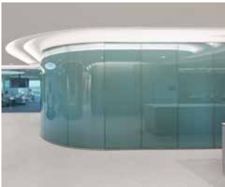
13.52mm clear custom switchable laminated curved glass privacy mode