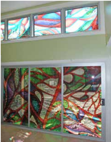
Photograph of original artwork