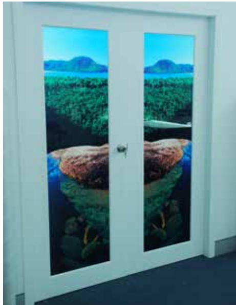
Photographic insert Office Doors