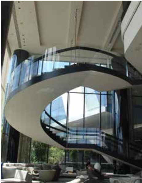
12mm clear toughened curved glass panels fixed into bottom channel cantilever balustrade