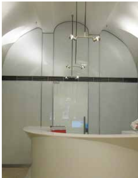
13.14mm low iron toughened white laminated flat glass shape cut reception wall