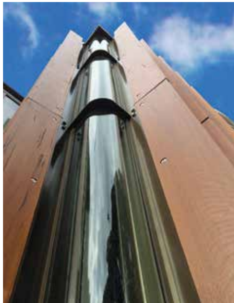
10.76mm clear laminated curved glass scenic lift