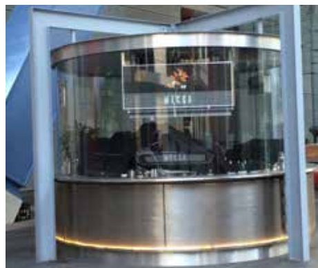
12.76mm low iron laminated curved glass counter