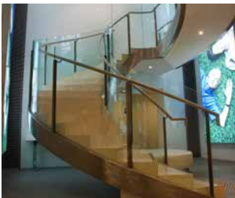
10mm toughened curved glass semi frameless balustrade infill panels