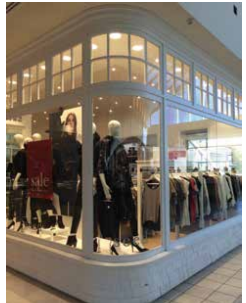
6mm clear toughened curved glass Shopfront