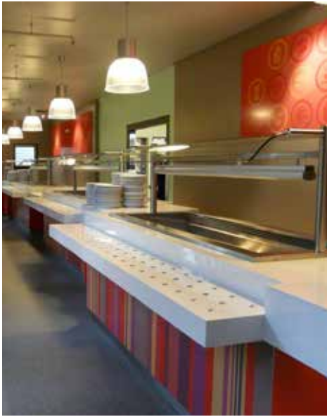
8mm clear annealed curved glass Custom profile sneeze guard