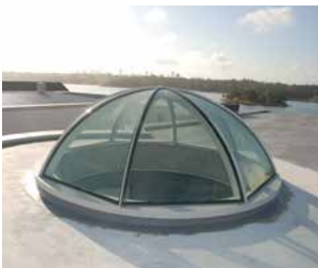
14.76mm low E laminated curved glass outlayer 8mm clear annealed glass & 6mm Viridian EnergyTech low E annealed glass dome light