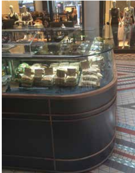
10mm clear annealed curved glass Custom profile