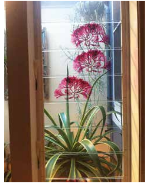
Photographic image Louvres