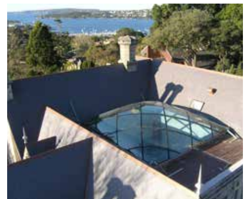
DGU: 12mm clear annealed external layer with 12mm swiggle seal air space & 13mm low E laminated internal layer