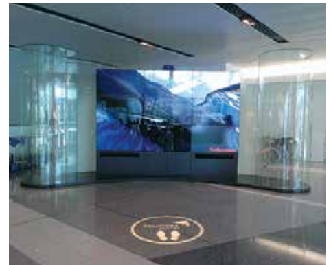
12.76mm low iron laminated curved glass end 13.65mm low iron toughened custom graphic laminated curved glass centre Airport screen