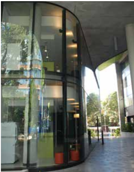
11.76mm low E laminated curved glass window facade