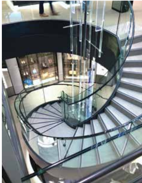
21.52mm clear toughened laminated curved glass stair balustrade