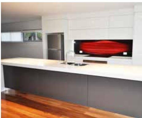
Photofile image splashback