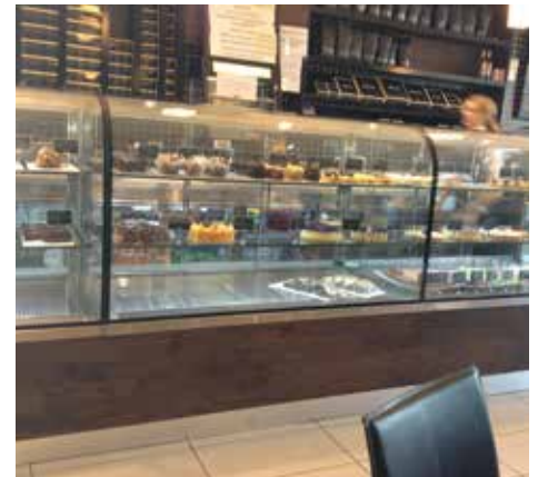
6mm annealed curved glass Standard 'AG' Profile