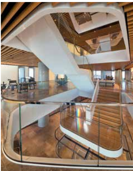
21.52mm Low iron toughened laminated curved glass. Non shrink grout fixing into bottom channel with stainless steel top rail