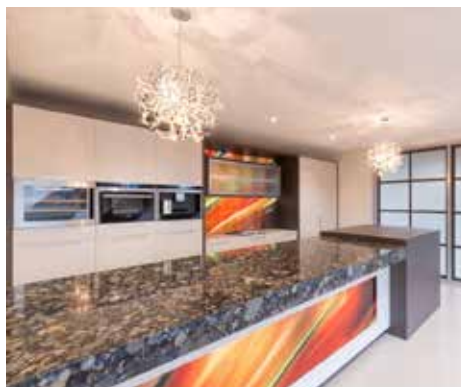
Digital image splashback & cabinet facing