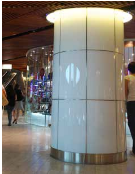
6mm Starphire toughened curved glass with white colourback paint