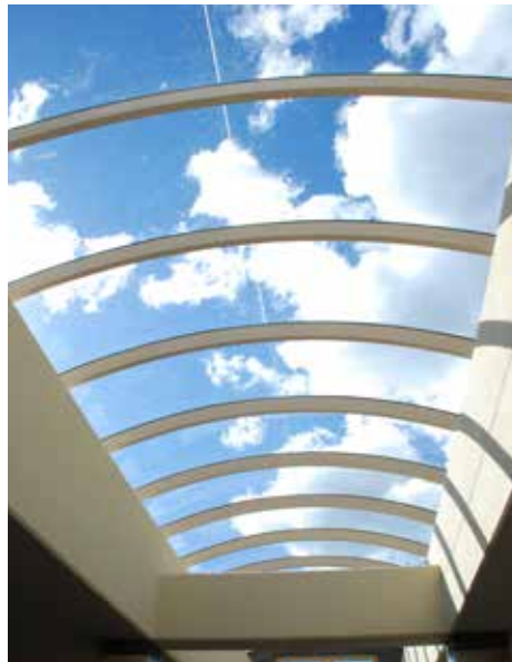
12.76mm clear laminated curved glass to barrel vaulted roof light internal view