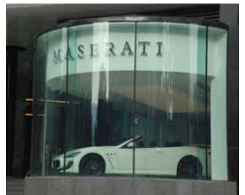
37.52mm clear laminated curved double glazed units