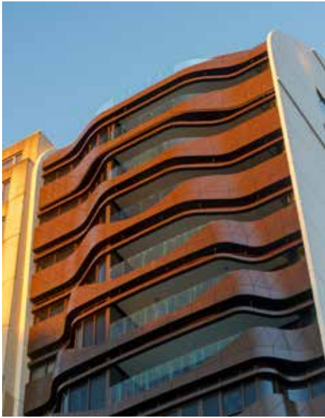
15.04mm clear toughened structural laminated curved and flat glass balustrade