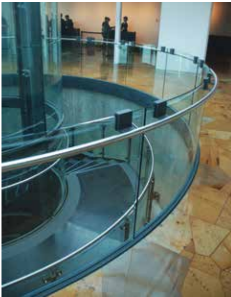
12mm clear toughened curved glass balustrade