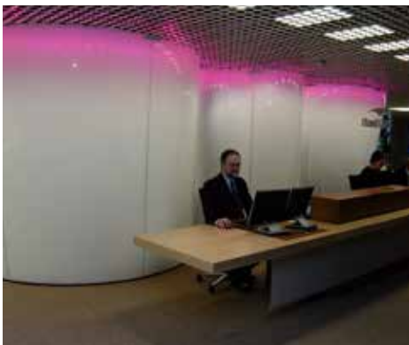
17mm curved laminated starphire glass panel with applied translucent film Lease Head office, Sydney