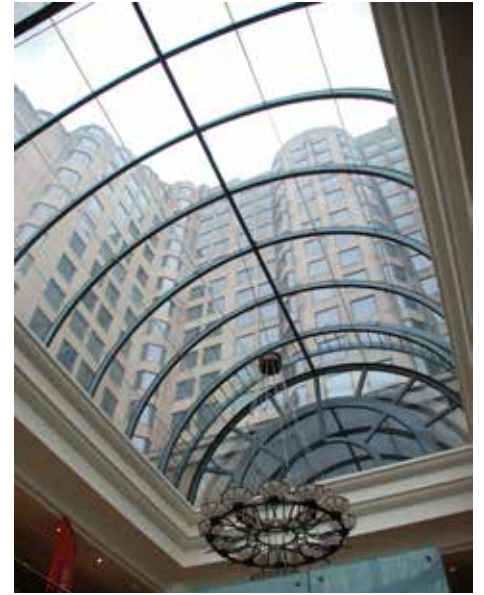
12.76mm grey tinted laminated curved glass atrium roof