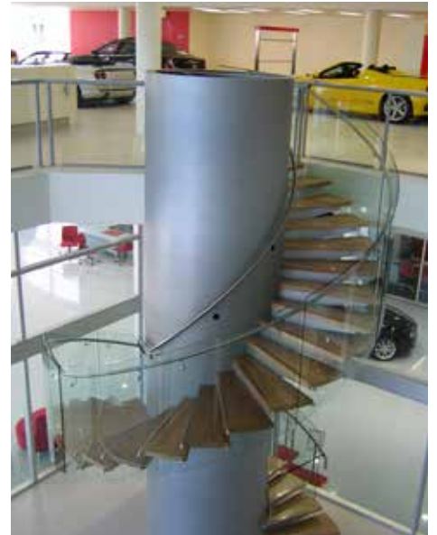
12mm clear toughened curved glass cantilever panels on stainless steel stand off patch fittings side fixed balustrade panels