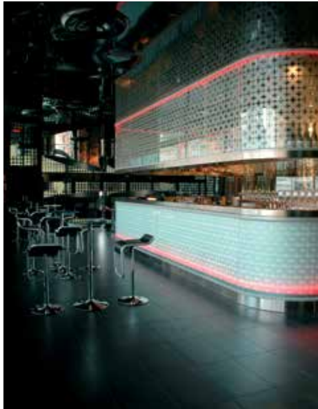
10mm clear toughened curved glass bar with applied decorative film Kaleido Bar, Melbourne