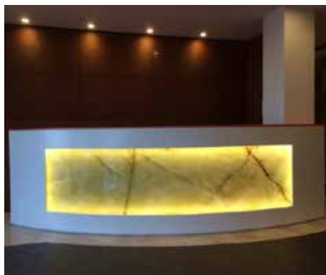
11.325 Low iron custom graphic white opaque laminated curved glass Impala Kitchen Showroom Drummonye