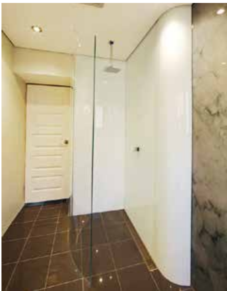
starphire toughened frameless shower screen & white colourback laminated curved glass shower recess Channel 9 show The Block 2010 Chez & Brenton's Bathroom