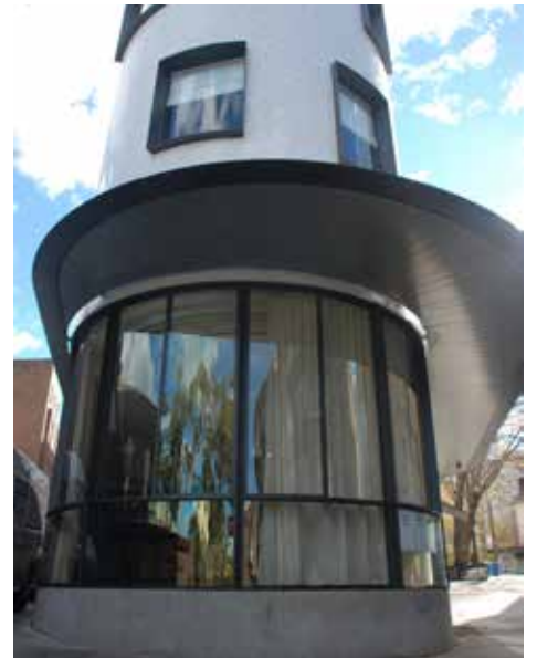
12.76mm Low E laminated curved glass window