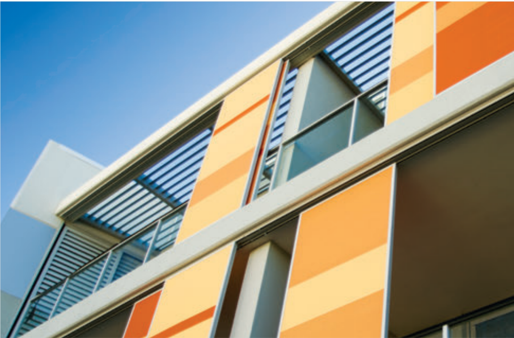
MIST® COLOURS TABLE 1.2