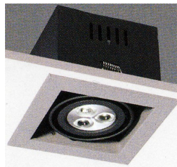
Cut Out - 115 x115mm

Multi directional downlight using LED to provide excellent light control and performance the gimble adjustment allows for precise centring of the beam for maximum effectiveness. The body and trim are manufactured from painted steel construction, while the lampholder ring is aluminium die cast. The internal lampholder ring is painted in black finish and the trim is silver. The square backing complies with wiring regulation-AS/NS3000:2007. All models require remote LED driver, (not included)