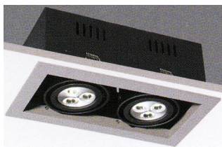
Cut Out - 220 x115mm