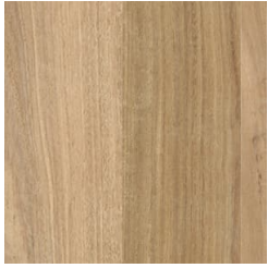
515 TASSIE OAK