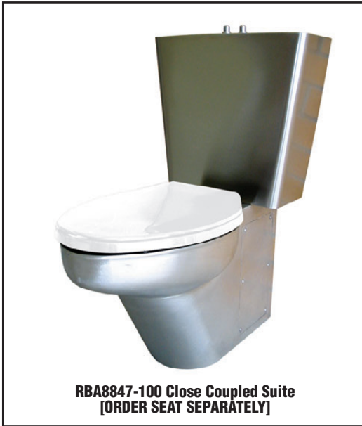
RBA8847-100 Close Coupled Suite [ORDER SEAT SEPARATELY]