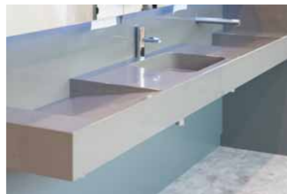
Silestone trough showing three design options