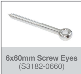
6x60mm Screw Eyes (S3182-0660)