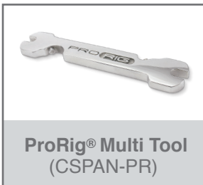
ProRig® Multi Tool (CSPAN-PR)