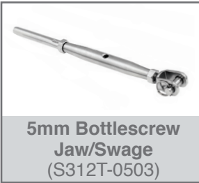
5mm Bottlescrew Jaw/Swage (S312T-0503)