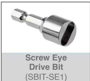
Screw Eye Drive Bit (SBIT-SE1)