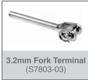
3.2mm Fork Terminal (S7803-03)