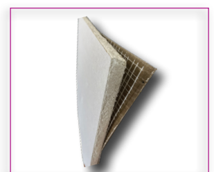
trurock hd comes with continuous fibreglass mesh embedded in the high density core