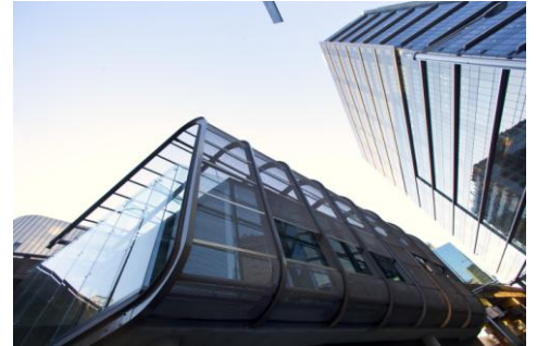
Hotel Ibis Façade, Sydney