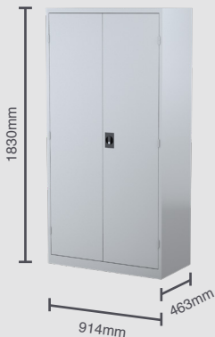
THREE SHELF UNIT