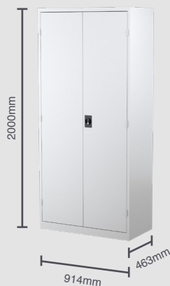
FOUR SHELF UNIT