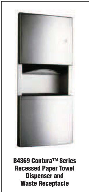
B4369 Contura™ Series Recessed Paper Towel Dispenser and Waste Receptacle