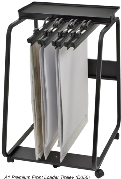
A1 Premium Front Loader Trolley (D055) with Systems Shelf (D056) & QUICKFILE Clamps (D200B)