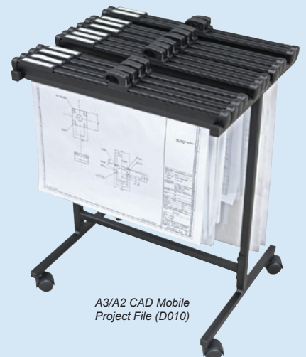
A3/A2 CAD Mobile Project File (D010)