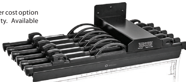
Front Loader Wall Rack WR1200 (D065)

The General Trolley is a lower cost option and has a 20 binder capacity. Available in A1 or A0 Size.