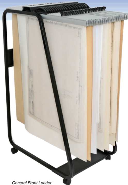
General Front Loader Trolley (D060) & GENERAL Clamps (D102A)

Hang-A-Plan Front Loader trolleys and wall racks provide clear and easy access to all drawings. Binders may be pivoted and removed from the front of the trolley without any obstruction. The trolleys are made from high strength steel frames finished in a satin black scratch resistant powder coat. The top channel, used for suspending binders, features an extra hard wearing nylon coated finish.