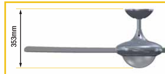
Dimensions of fan with Light Kit