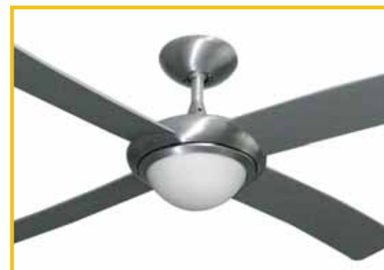
View of fan with Light Kit fitted