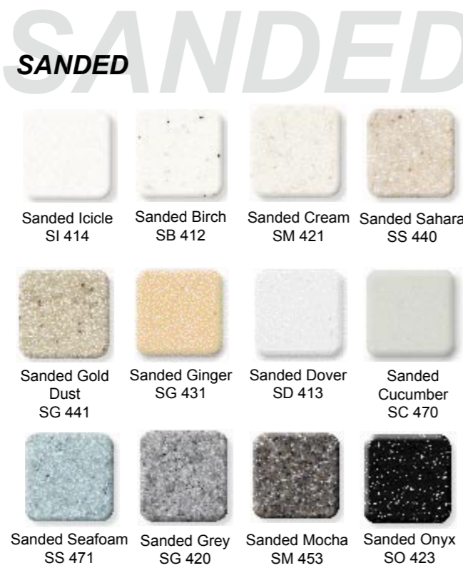
Sanded: Small, sand sized particles are blended to create a consistent even texture.

* Commercial Designs ** Cumulus is a highly translucent design