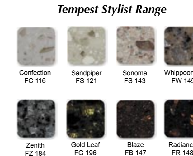
Tempest Stylist: New technology with clear chips and traces of silver, gold and copper.