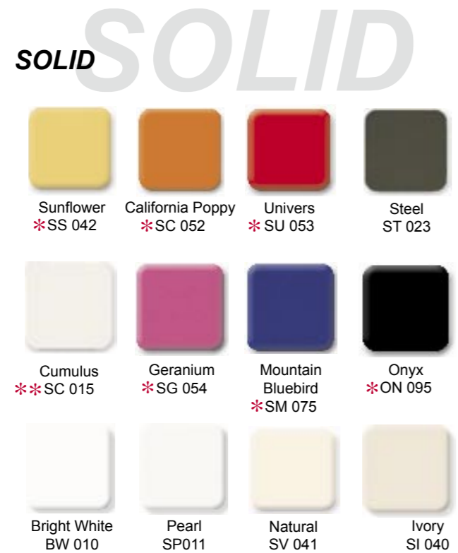
Solid: A range of ideal residential benchtop colours as well as some strong unique commercial designs.

* Commercial Designs ** Cumulus is a highly translucent design