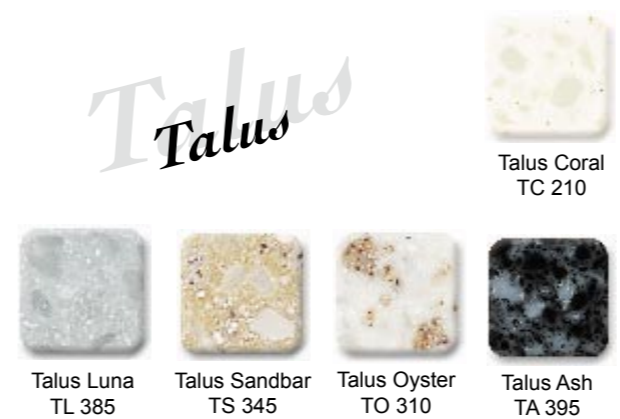
Talus: Slightly translucent colours are combined with crystal flecks in various particles sizes.