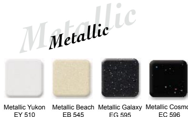
Metallic: Crystal flecks create impressive looks.