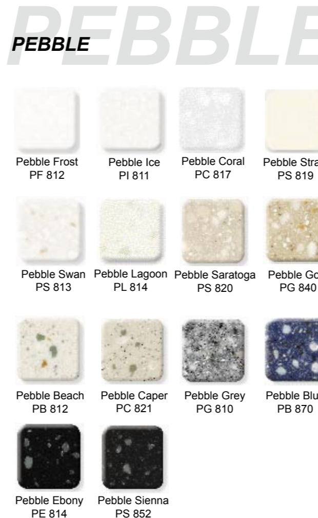
Pebble: Both large and small particles are combined to create a stone impression.