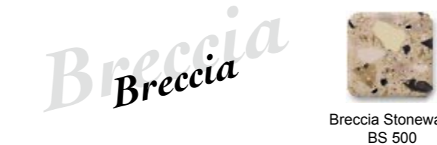
Breccia: Our newest series. Both dark and translucent particles combine to create a beautiful mosaic pattern.