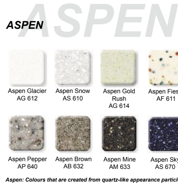
Aspen: Colours that are created from quartz-like appearance particles.