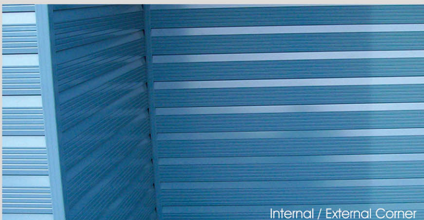
Internal / External Corner