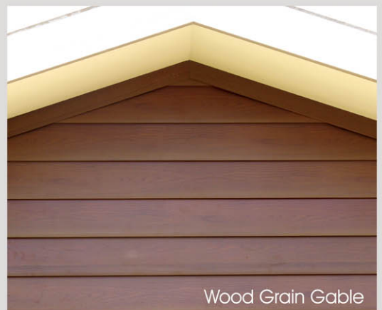
Wood Grain Gable