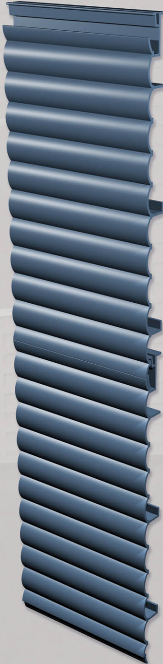
190mm Full Corrugated Weatherboard