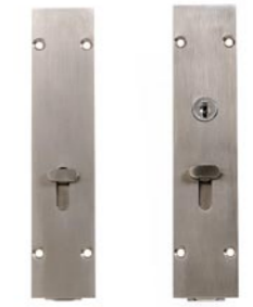
575 SS 575E SS KA5