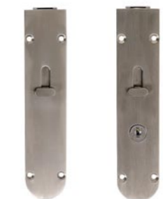
575R SS 575RE SS KA3