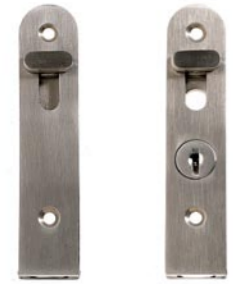
550 SS 550E SS KA1

Product Code Description Finish Ctn qty Pack