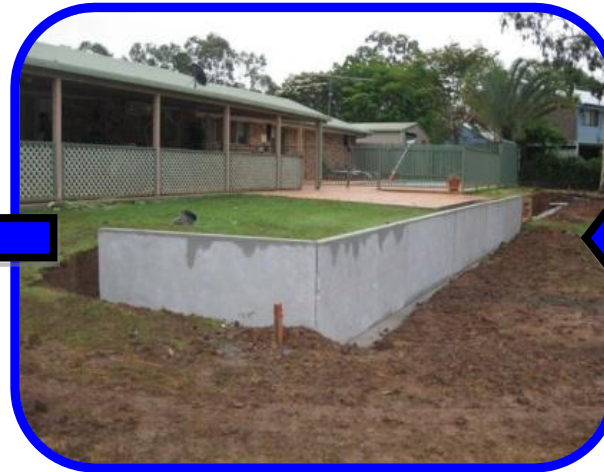
Day 2 (AM) Ready to Backfill