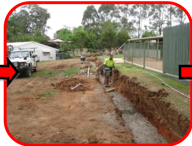
Day 1 (AM) Compacting Base Course