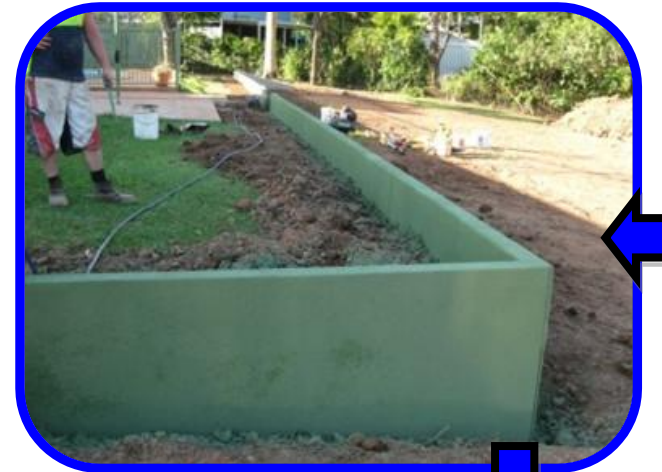
Day 2 (PM) Paint (if Desired)