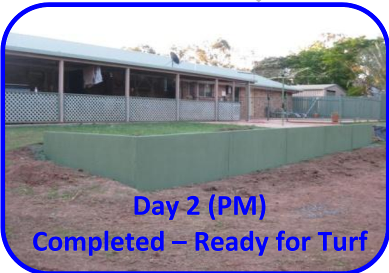
Day 2 (PM) Completed - Ready for Turf