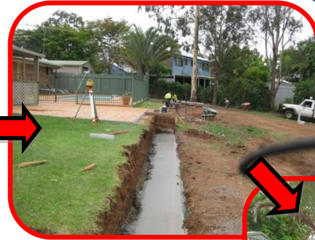
Day 1 (PM) Bedding / Blinding