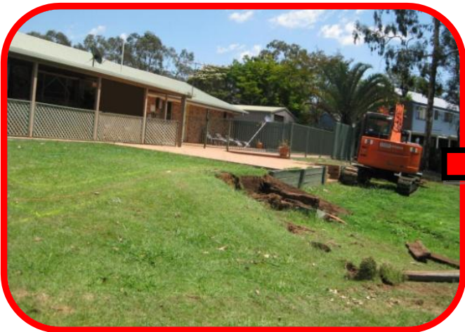
Day 1 (AM) Mark Out & Cut