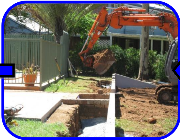
Day 2 (PM) Backfilling