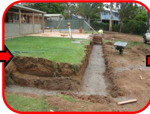
Day 1 (AM) Crusher Dust