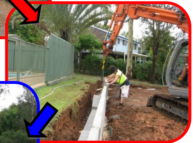
Day 1 (PM) Crane in Panels