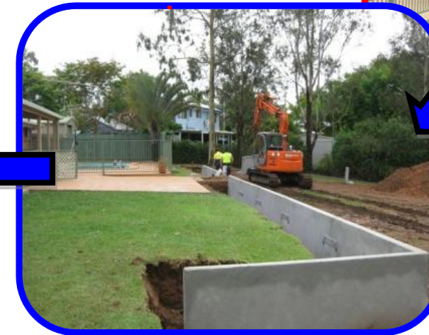
Day 2 (AM) Bolted Together with Joiner Plates