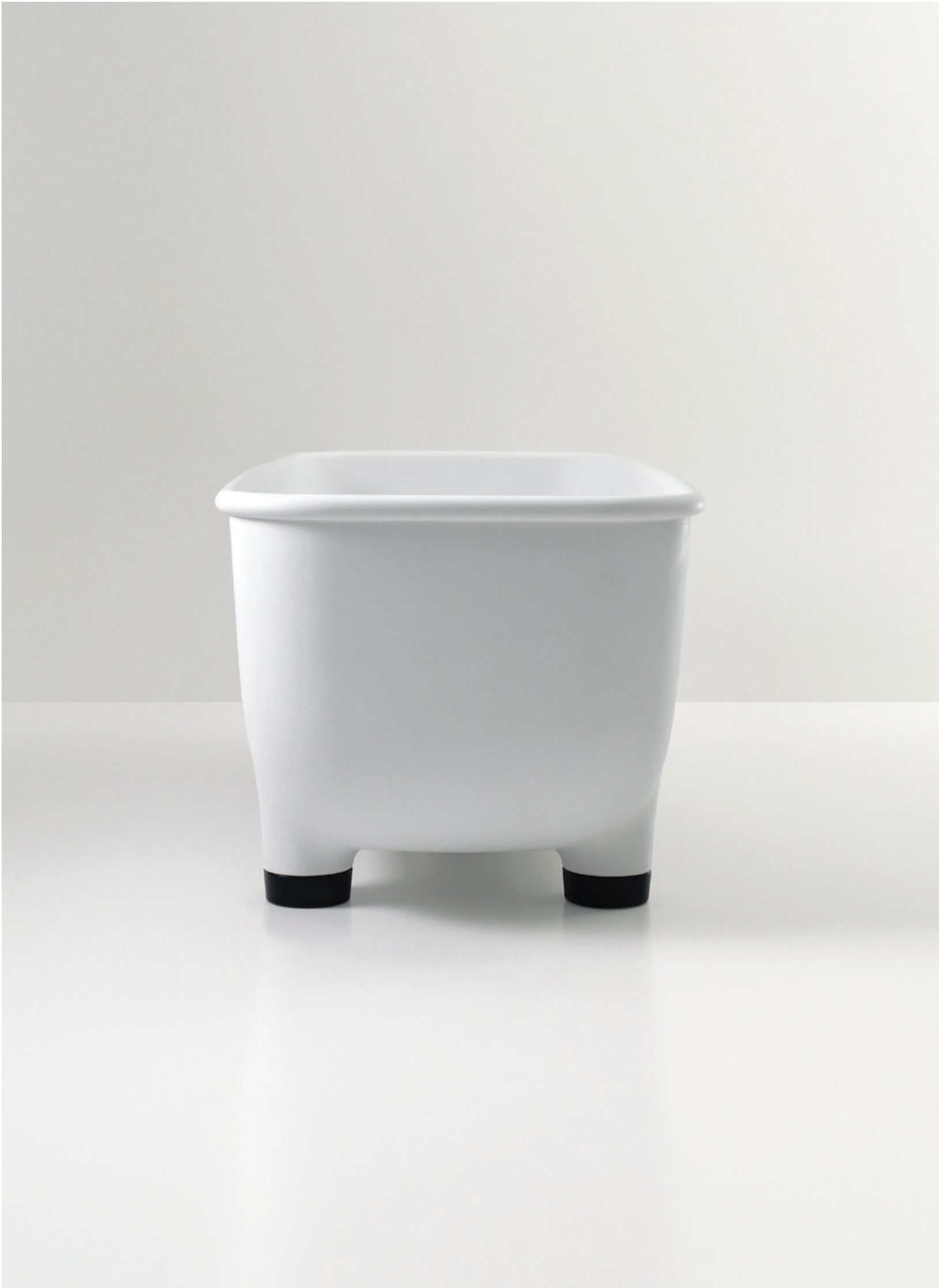
freestanding bath CMN8W freestanding bath filler CMN92010C