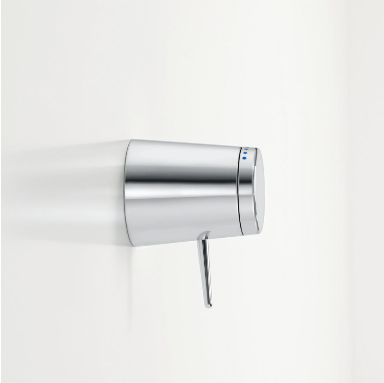
rail shower with overhead CMN92008C3A shower mixer CMN92003C also available in chrome-white and chrome-black