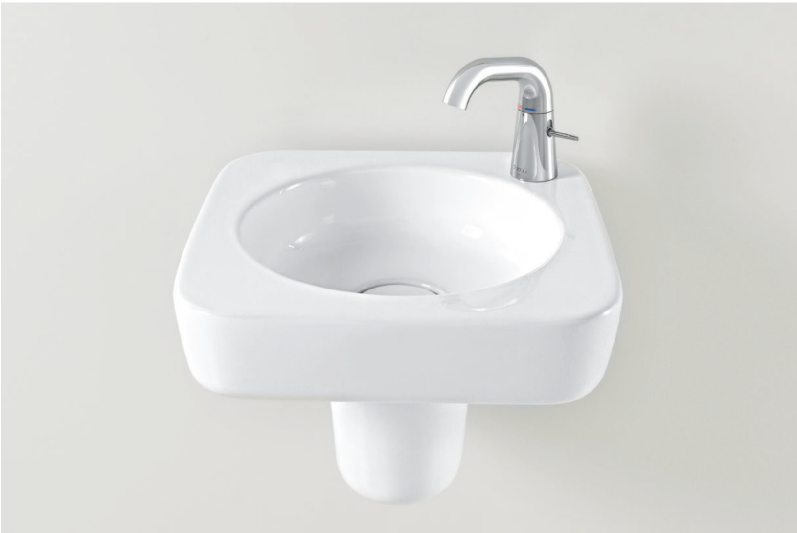
above counter basin CMN895010W basin mixer CMN92000C5A wall basin CMN869310W shroud CMN869350W