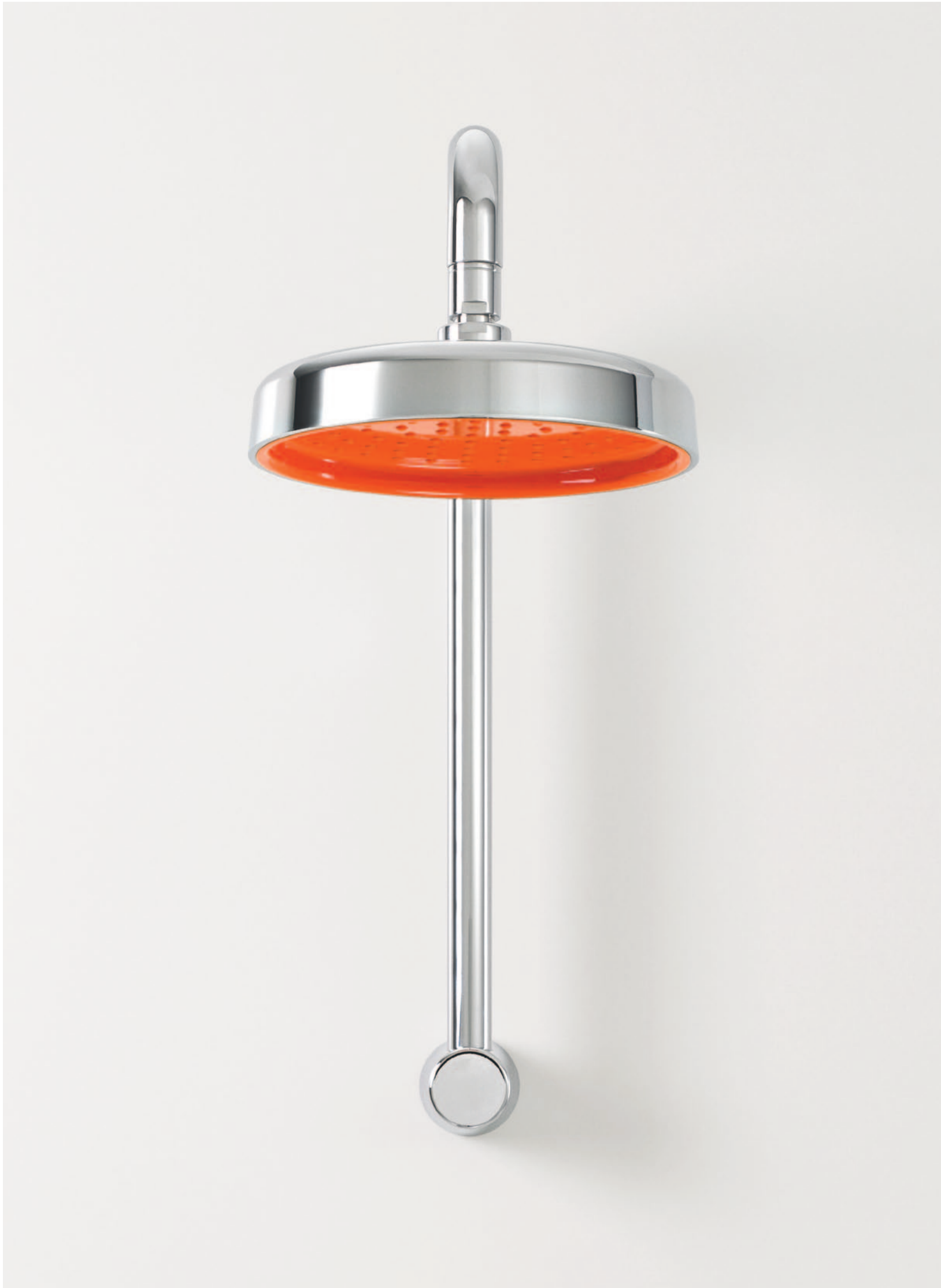
fixed wall overhead shower CMN92005C3A also available in chrome-white and chrome-black