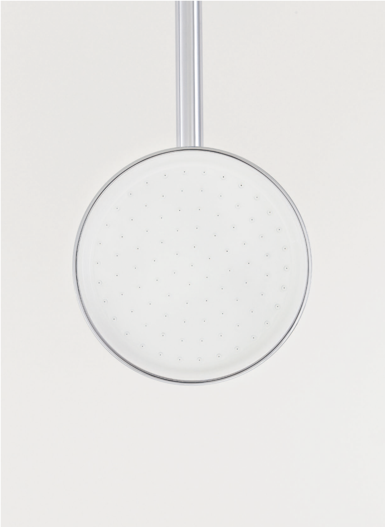
fixed wall overhead shower CMN92005CW3A also available in chrome-orange and chrome-black