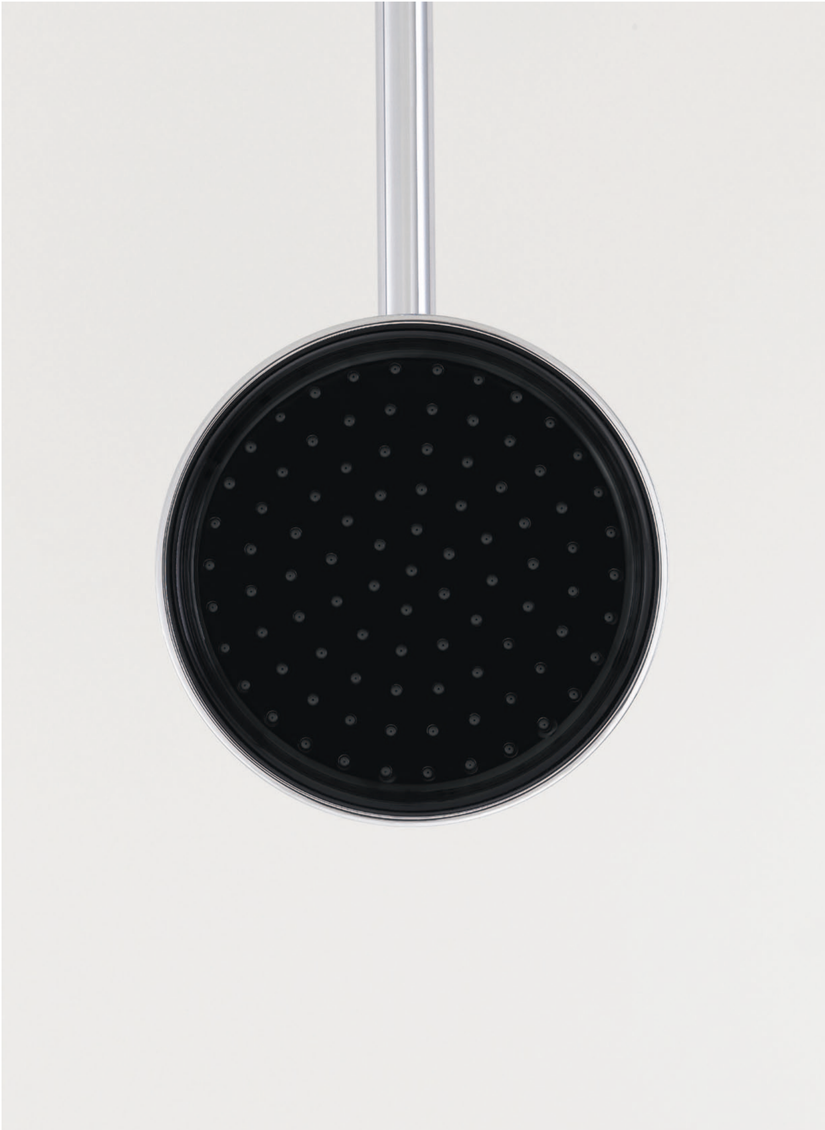
fixed wall overhead shower CMN92005CB3A also available in chrome-orange and chrome-white