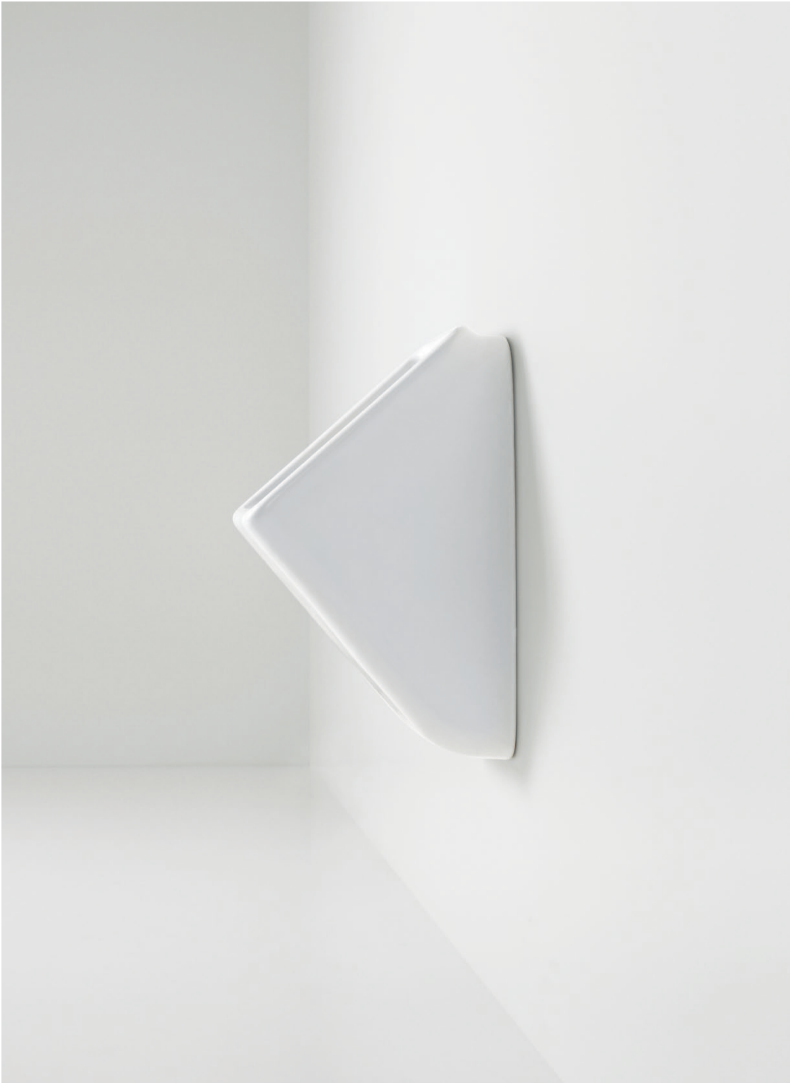
wall faced Invisi II™ toilet suite CMN775100W wall hung Invisi II™ toilet suite CMN775200W electronic urinal suite 678661