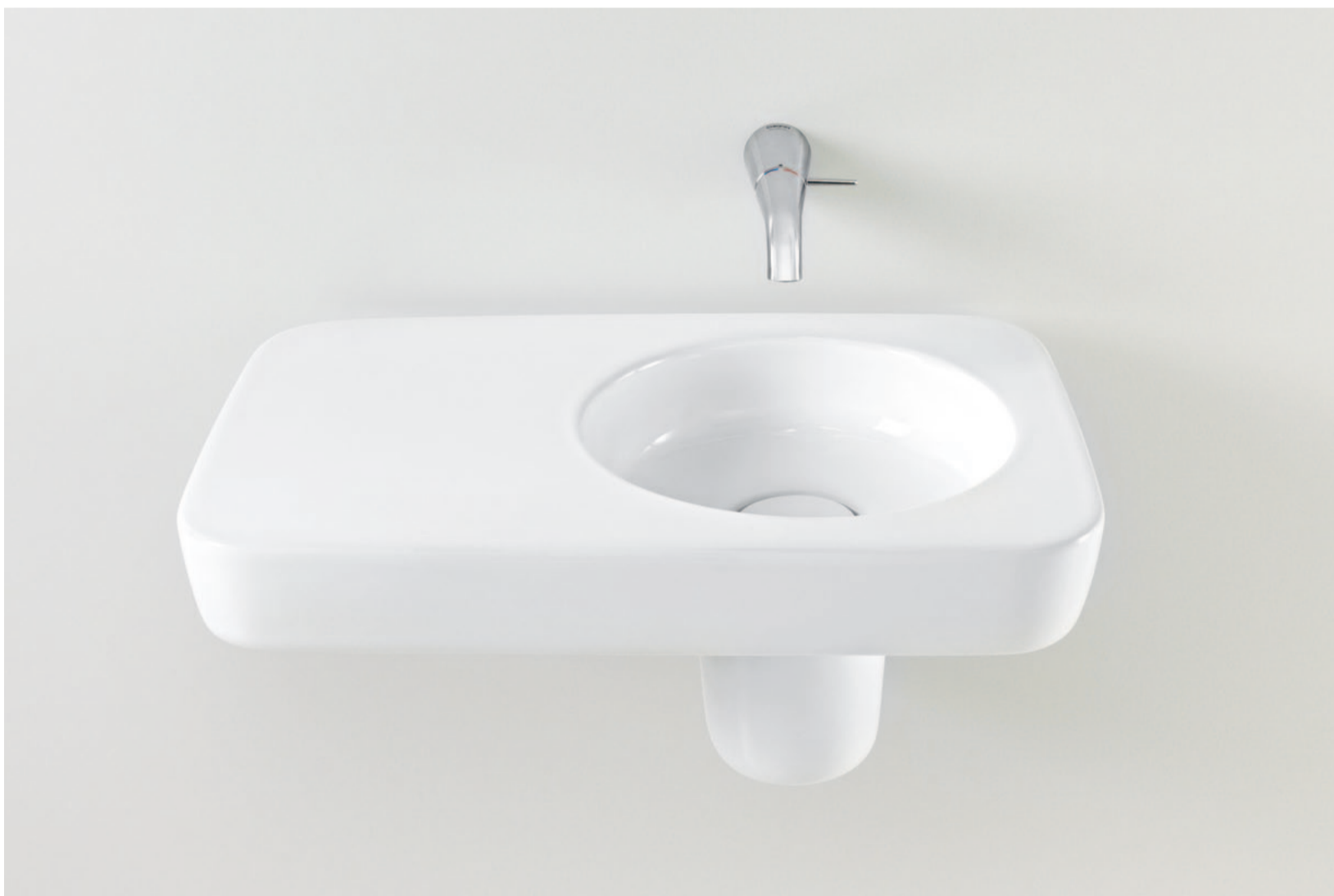
wall basin mixer CMN92001C5A wall basin left hand shelf CMN869500W shroud CMN869350W wall basin right hand shelf CMN869400W