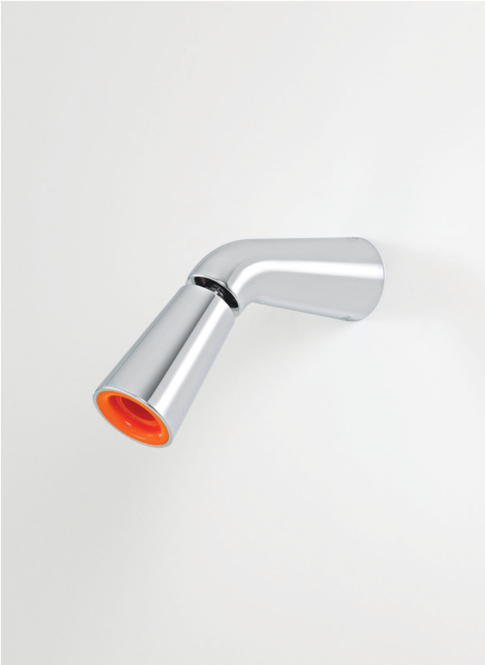
fixed wall shower CMN92004C3A hand shower CMN92006C3A also available in chrome-white and chrome-black