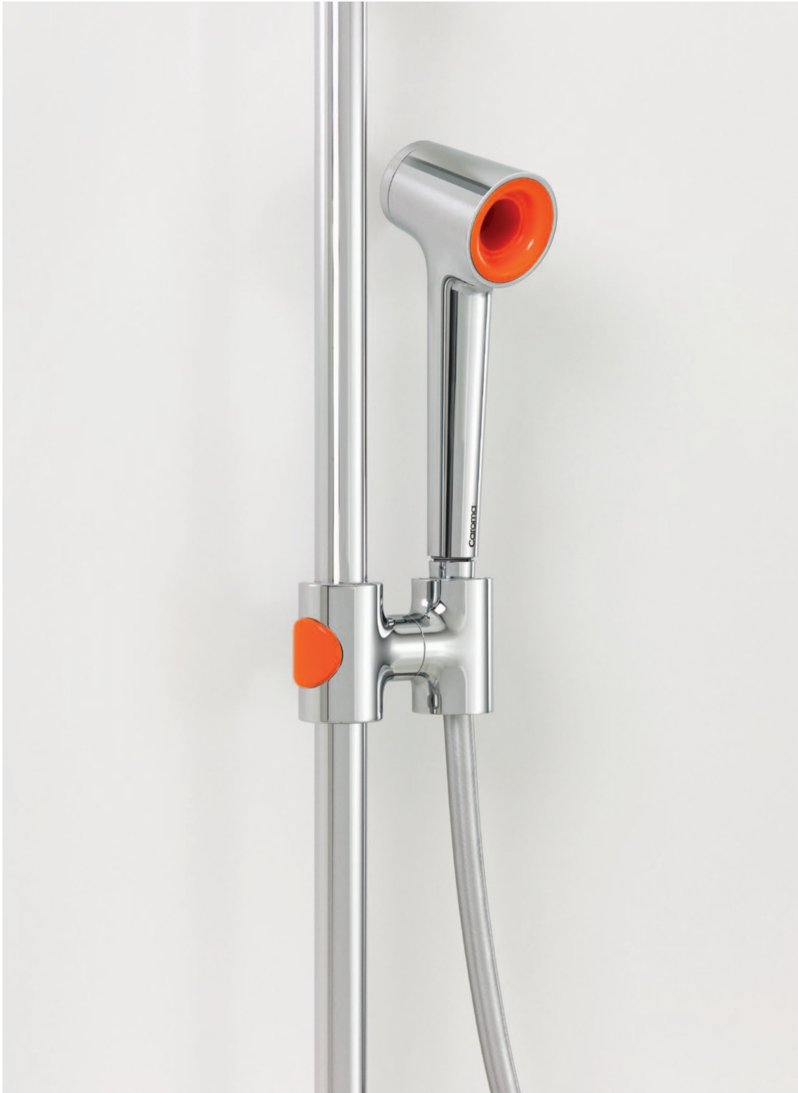
rail shower CMN92007C3A also available in chrome-white and chrome-black shower mixer sold separately