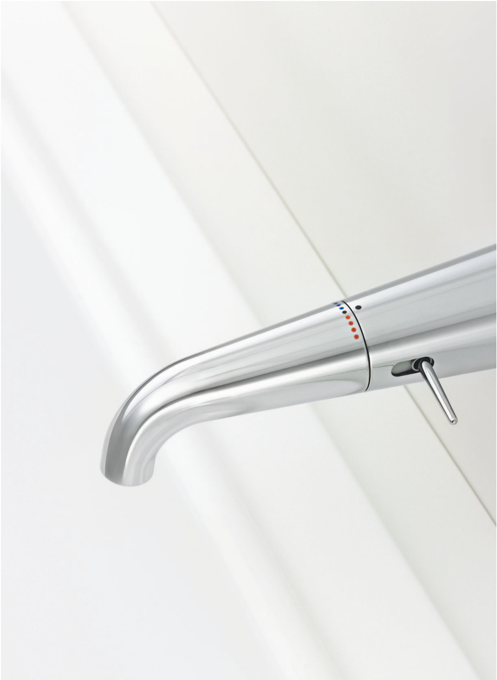
wall bath mixer CMN92002C