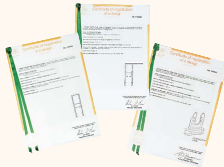
Design Certificates for Maxiblock® Shutter components