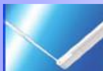
3 wash functions