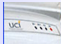
Eco power saving