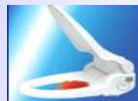
Warm air dry