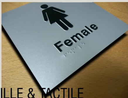
BRAILLE & TACTILE