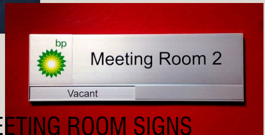
MEETING ROOM SIGNS