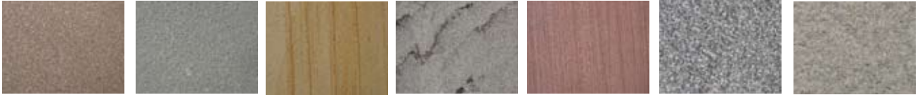
Outback Dust Heron Green Savannah Gold Kakadu Mist Kimberley Red Bendigo Ash Ironbark Grey

Stoneazy's lock fast sandstone colour range includes Kimberley Red, Outback Dust, Ironbark Grey, Kakadu Mist, Savannah Gold, Bendigo Ash and Heron Green.