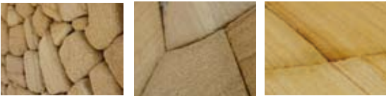
Pebble pattern Random Pattern Ashlar pattern

There's also a host of stone patterns to increase your options in the lock fast floor, wall, pillar and cobble range. Choose from natural "Pebble" stone shapes featuring smaller sized stone, to the popular larger sized, "Random" option. Otherwise you can select the timeless appeal of the "Ashlar" pattern, comprising of uniformly shaped stone of various size.