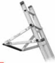
SafetyLink Portable LadderLink