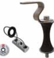
SafetyLink Single End with Retotube