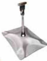
SafetyLink Advance Intermediate T-Bolt