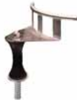
SafetyLink Single Concrete Corner Unit