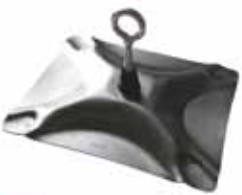
SafetyLink Advance Surfacemounted Aluminium