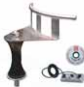
SafetyLink Single Corner with Retotube