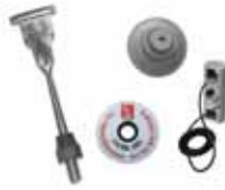
SafetyLink Intermediate T-Bolt with Retotube