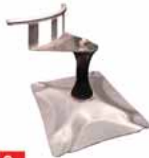
SafetyLink Advance Corner Unit