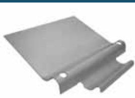
SafetyLink Fixed LadderLink