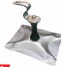
SafetyLink Advance End Unit