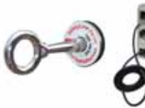
SafetyLink RetroLink Tube