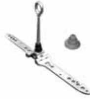
SafetyLink HingeLink (stainless steel)