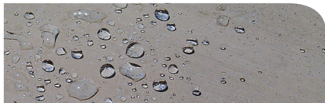
CCS penetrating sealers repel water while allowing the surface to breathe.