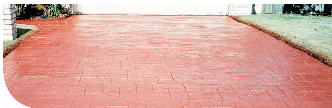
Revitalise existing concrete with CCS Coloured Sealer.

By mixing the 2 litre tint pack with the 18 litre CCS Colour Master Seal, you can produce several opaque coloured sealers. The CCS Colour Master Sealer incorporates a very high acrylic solids content and is specially formulated to accept the CCS tint packs without the colour settling. Please ask your applicator for the latest sealer tint colours available.