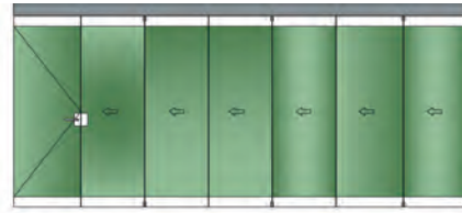
A. Access door at stack end.

Note: The overhead structure must be designed to support the door weight. Monarch can provide self-standing trusses and columns if required.