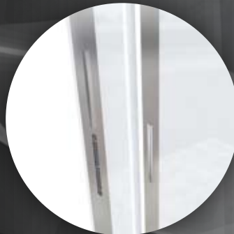
Elegant integrated interchangeable handle