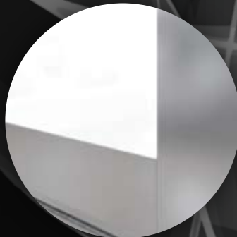
Contemporary design with flush-mounted infill panels