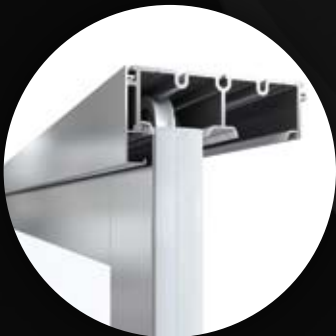
Low profile PVC top and bottom track