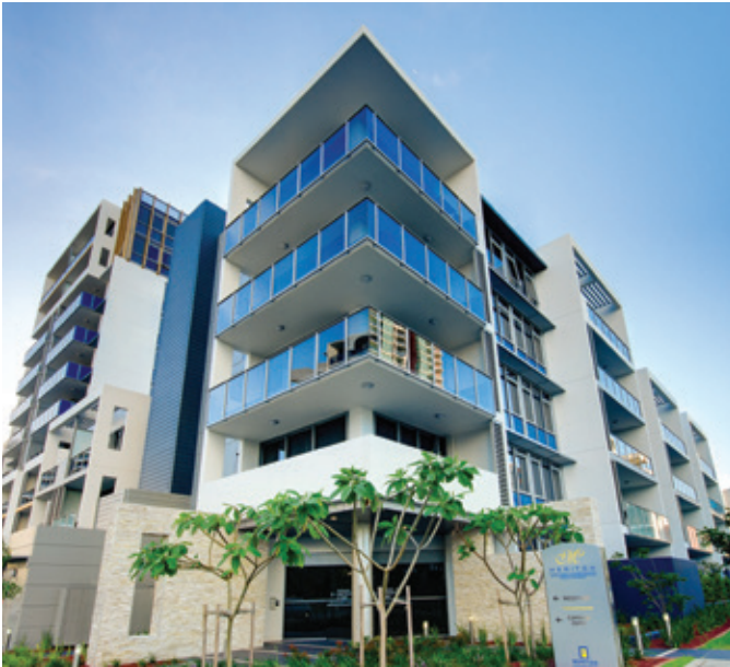
'Regatta' at Brighton on Broadwater, Gold Coast