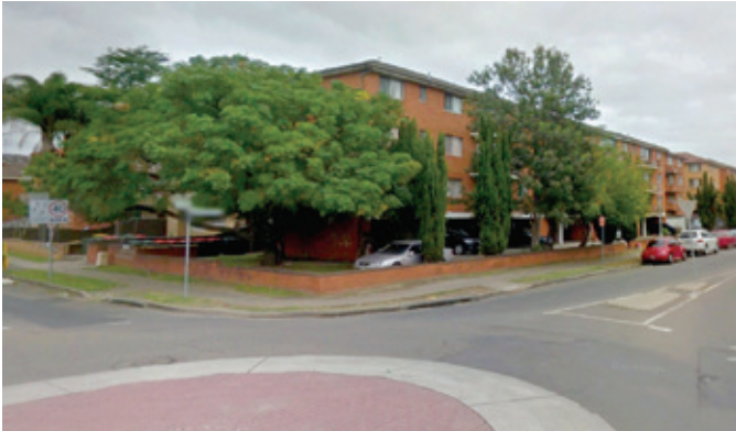
Existing corner view