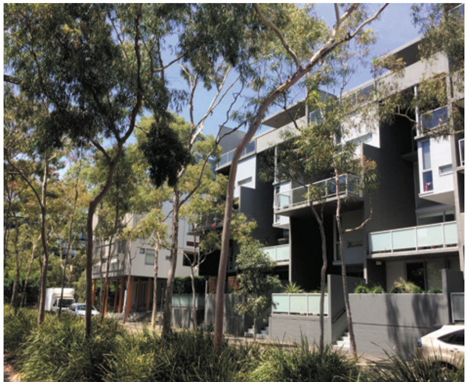
Garden apartments at Victoria Park

The overall height means that street trees become a canopy providing scale and giving a forest character. The top level apartments are set back with even larger outdoor terrace areas for gardens.