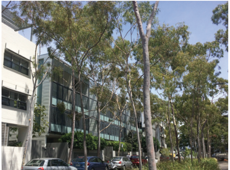
Apartments within the tree tops at Victoria Park

As well as the outdoor spaces, many mid-rise apartments have indoor shared amenities with gymnasiums, indoor pools and libraries and lounges. These facilities encourage residents to meet together so developing a sense of community. The photographs are of Top Ryde by Crown Group.