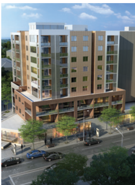
Artist's impression of the Merrylands apartments