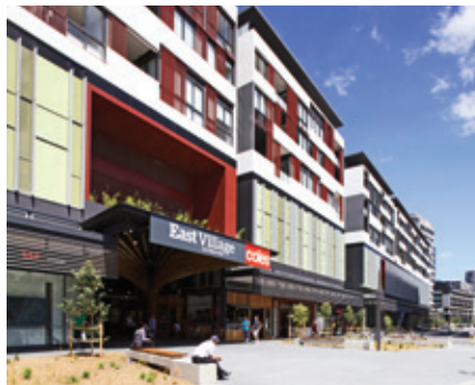
East Village showing street-edge retail