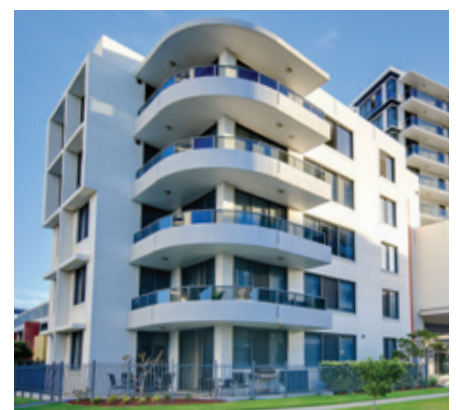
'Dune' at Brighton on Broadwater, Gold Coast

In South Sydney, Fusion at Arncliffe has six to eight storey buildings and Eon at Zetland has five to six storey buildings. The Vantage South apartments at Rhodes are six storeys.