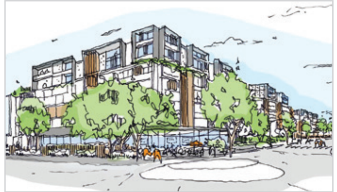
Proposed corner view with the new code based apartments