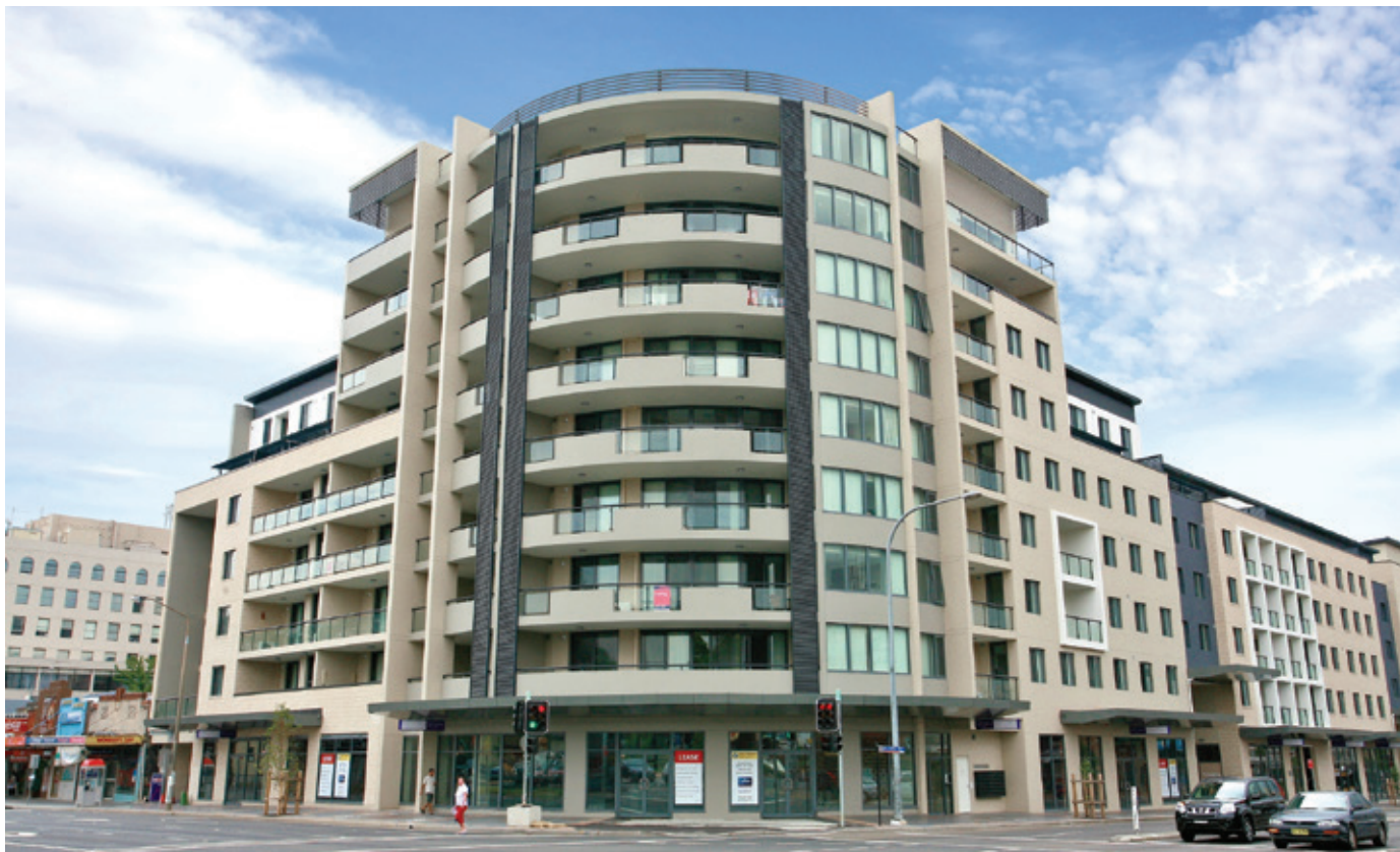
'Entrada' on the corner of Church and Victoria Road, Parramatta