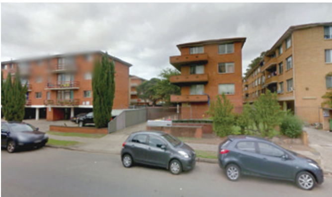
Existing street view