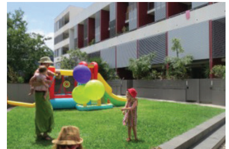
Images above showing the Spectrum community