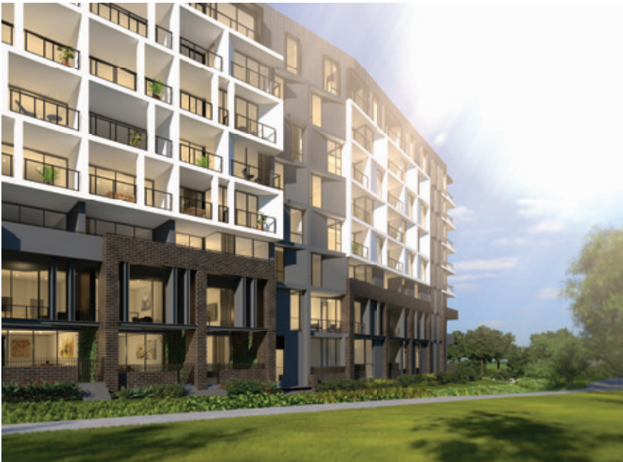
Harold Park Chevalier