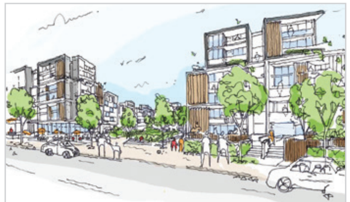
Proposed street view with the new code based apartments