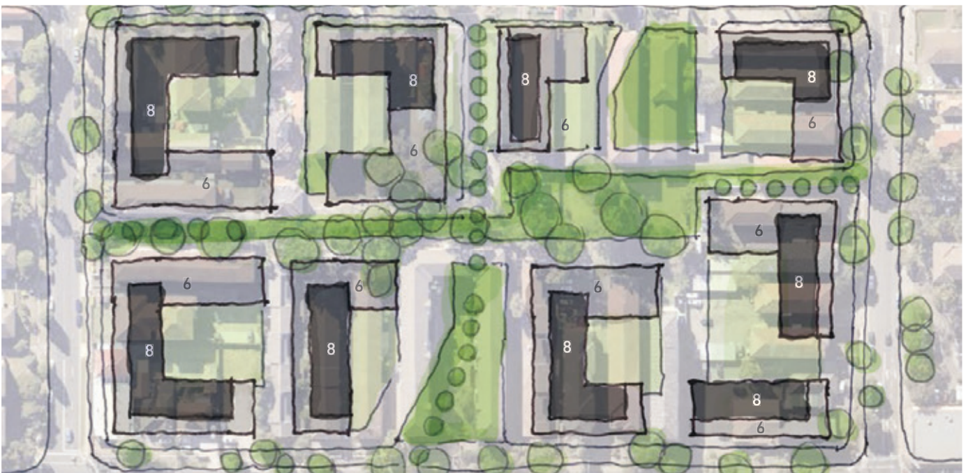
Proposed site massing – option one