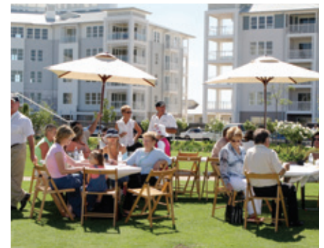
Seniors community within apartment living