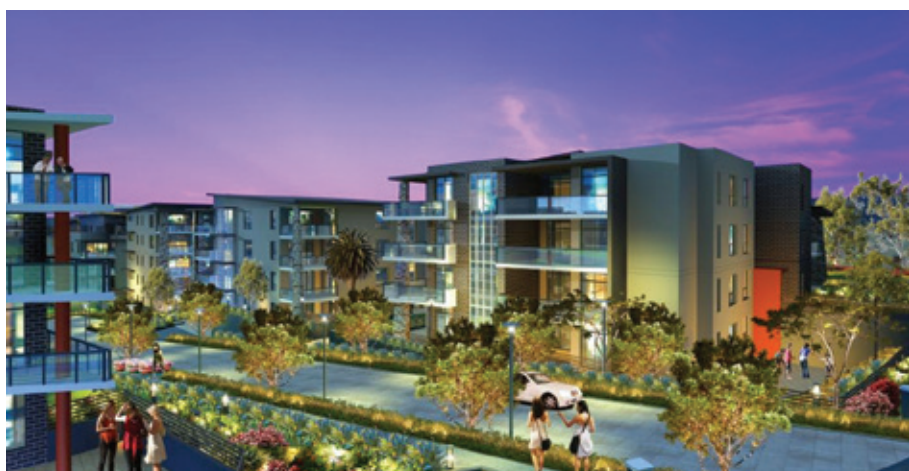
Bella Vista apartments

Dyldam have their head office in Parramatta and understand the Western Sydney market well. Their Entrada apartments sit in an urban location in Parramatta and are able to get 9 storeys into the Building Code of Australia 25 metre height control. The tallest part of the building emphasises the corner and the building form steps down away from the corner.