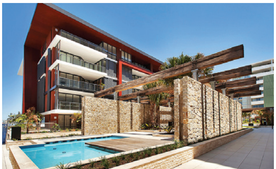
Shared facilities for the community of this apartment block in Top Ryde