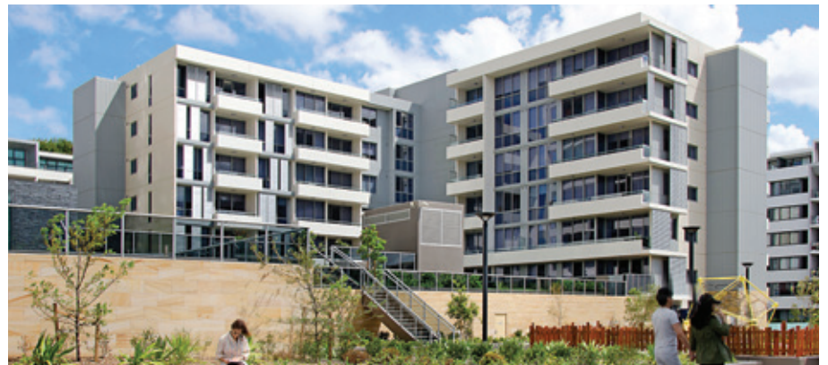
'Vantage South' Rhodes