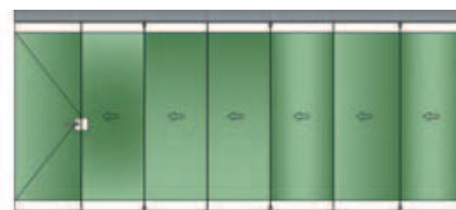
A. Access door at stack end.