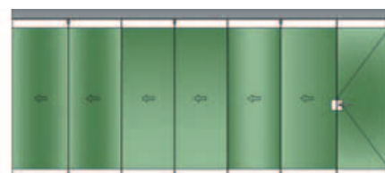
B. Access door opposite stack.