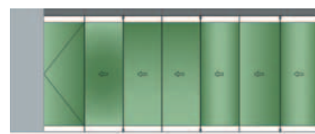
D. Icon housing with swing door.