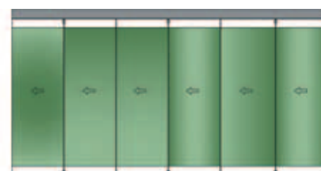
C. No access door (even panels, stack only).