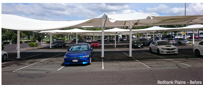
Redbank Plains - Before