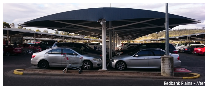
Redbank Plains - After