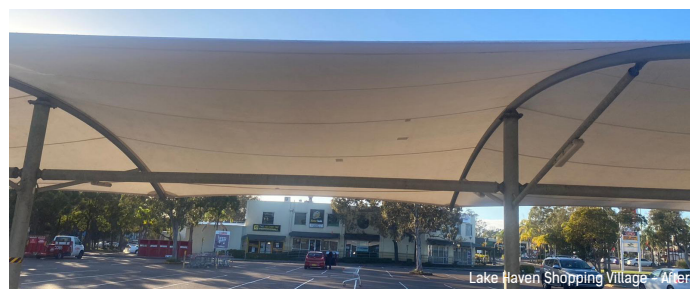
Lake Haven Shopping Village - After