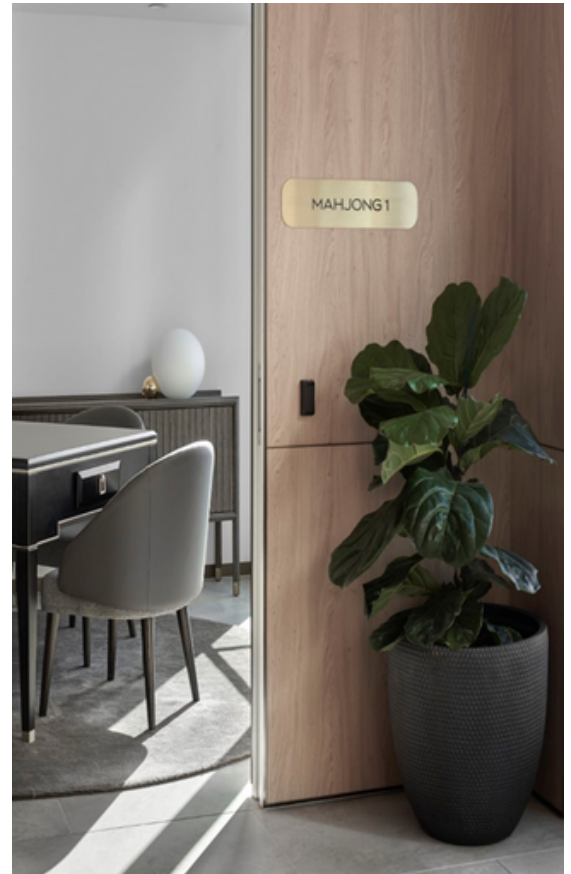
The SlideSet's minimalist detailing makes for a premium, clean finish to the interior space.

Reward your construction vision with the care it deserves; contact us and learn how at sales@studcosystems.com.au or 1300 255 255.