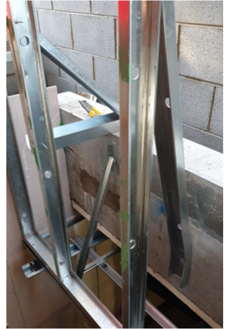
The internal framing of the pool room's cantilever wall.