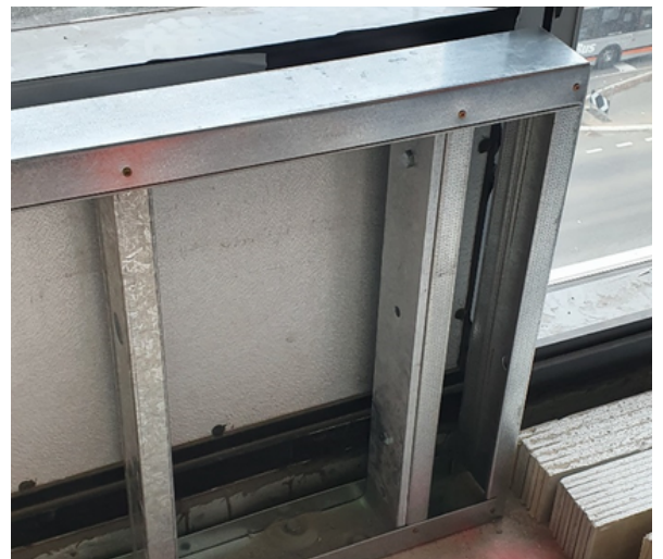
The StrongArm brace installed to support a half-height wall in an apartment.

Studco modified the StrongArm Structural Wall Brace to suit the requirements of this project. The brace was specified to bring additional structural support to a number of half-height and free-standing walls throughout. As seen below, the brace is simply fixed to the stud to improve rigidity and minimise lateral deflection. This made for a quick on-site solution as opposed to using structural steel framing. Being a large-scale commercial construction, this ease of application was important in the time sensitivity of the Sky Garden project. The Studco team manufactured the StrongArm braces in custom sizing to suit Oneway Construction's requirements.