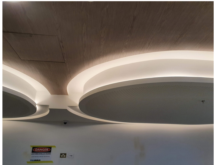
The same ceiling light feature – completed. The simple lock-in installation of the EzyTrack creates curves quickly and easily.