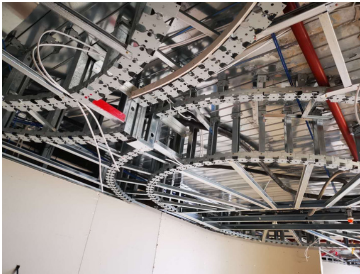
The EzyTrack curved wall track forming the curvature of the feature lighting.