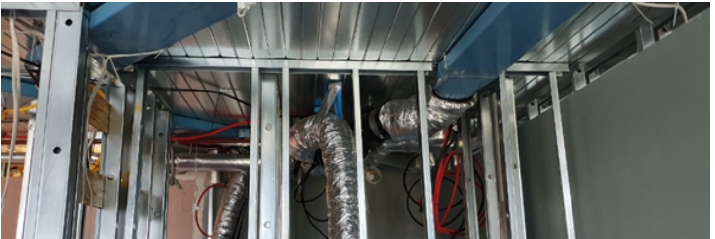
Internal partition walls and fire-rated walls at Sky Garden are constructed from Studco's steel Stud system.