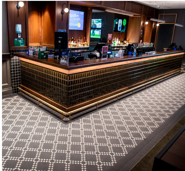
Seven Hills - Toongabbie RSL Club's $30M revamp includes mosaic style 'MO6' black on white flooring from Tessellate Tile Factory surrounding the bar area.

In depth psychology it is often said that when paradoxes (so many paradoxes in tiles!) are somewhat resolved, what results is a symbol. Let's hope that the Tessellated Tile Factory, with its attention to craft, its vibrant approach to design, combined with both enthusiasm and sound business sense, is genuinely a symbol of what the Australian tile industry could become over the course of the current decade.