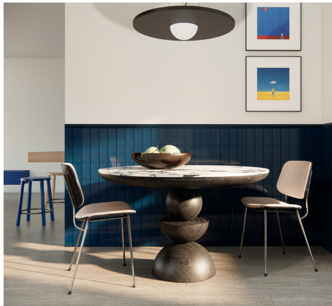
In addition to its specialised tessellated tiles, the Tessellated Tile Factory carries designs such as these deep blue subway-style tiles shown above.