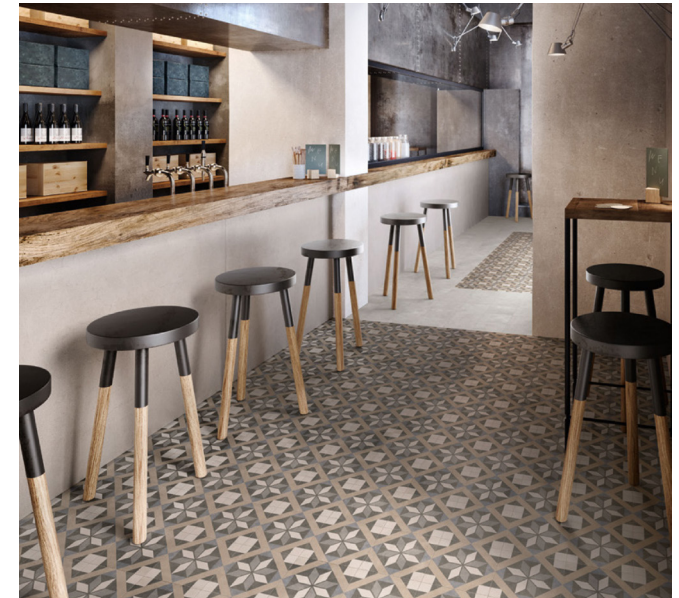
Along with its own products, Tessellated Tile Factory also provides tiles from the Italian supplier Ceramica Sant'Agostino, as shown above.