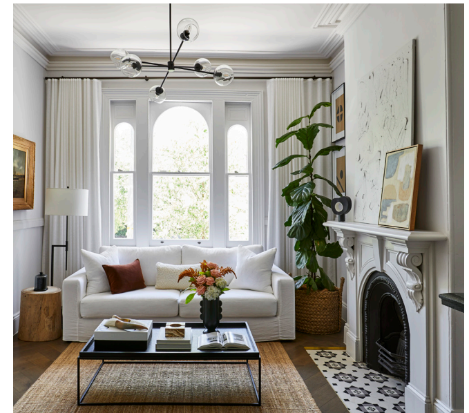
Tessellated tiles are ideally suited to fireplaces in Federation homes, and the Tessellated Tile Factory offers specialised help in designing these installations.