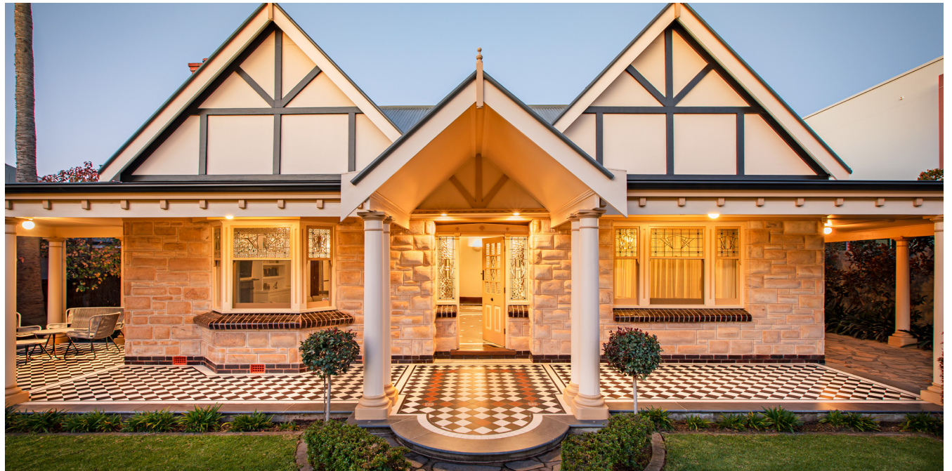
Tessellated Tile Factory's classic black and white checkerboard tessellated design complements this American Tudor home located in the Toorak Gardens suburb east of Adelaide, SA. Glazed bricks, stone cladding and a formal front garden are