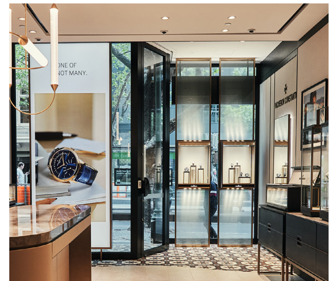
Interior of Vacheron Constantin boutique in Melbourne's Collins St. Interior tile continues the heritage of the existing exterior tile.