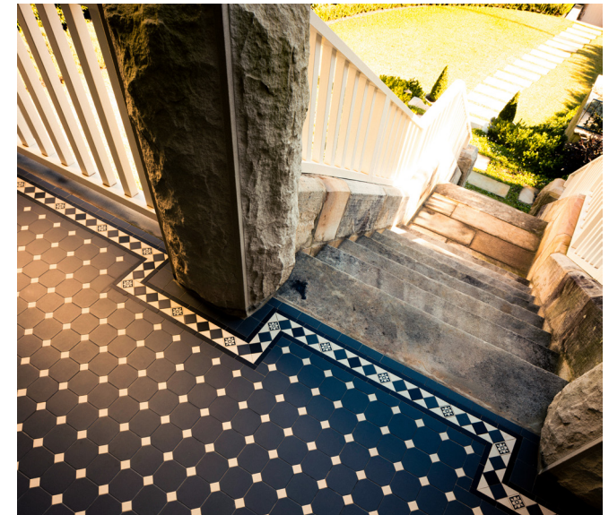
Detail of a front verandah of a house in Sydney's affluent suburb of Mosman. TTF's tessellated octagon and dot pattern in black and white, with border trimmings that include TTF's 'Bordeaux Neative' tessellated encaustic.