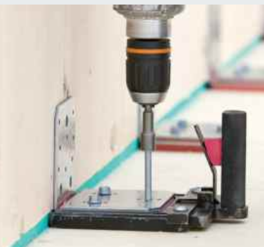
Elastic angle bracket ABAI 105

A top-quality indoor environment requires effective protection from airborne and impact noise. Sound insulation within the building is just as essential as sound insulation against noise from outside. The construction company contacted Getzner, a specialist in vibration insulation, for help in minimising sound transmission. The result was an outstanding sound insulation solution.