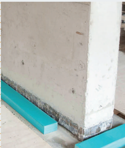
Detail of the pointwise support of the Mezzanine floor. Bearing dimension customized according to given performance criterias as well as specific loading.